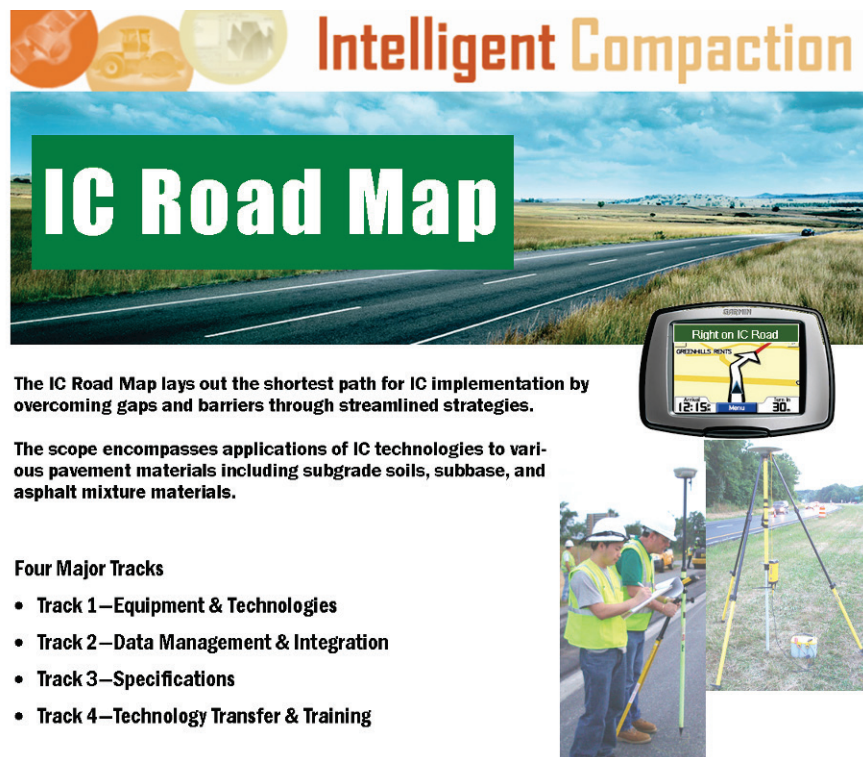
Figure 1. The Intelligent Compaction Road Map (Transtec Group)

The FHWA/TPF project, led by the Transtec Group, also developed an IC Road Map that addresses the gaps and barriers for implementation that includes four major tracks: (1) Equipment and Technologies, (2) Data Management and Integration, (3) Specifications, and (4) Technology Transfer and Training (see Figure 1). An extensive knowledge base was built from those field demonstrations and is readily available to the public via the IC website ( www.intelligentcompaction.com ), also developed and maintained by the Transtec Group. The IC National Workshops under the FHWA TOPR No. 5 (DTFH61-10-D-00027) are intended to address key elements of the IC Road Map.