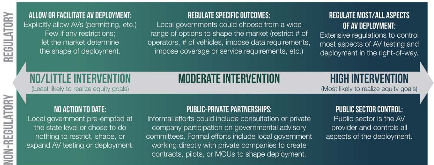
FIGURE 4. SPECTRUM OF LOCAL GOVERNMENT POLICY INTERVENTION FOR AV DEPLOYMENTS