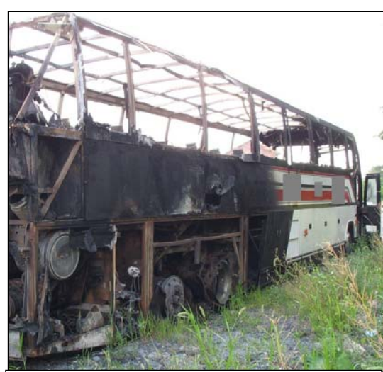
Figure 10: Right side damage to the motorcoach.