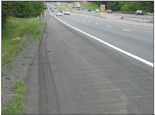
Figure 14: Tire mark visible in look-back of motorcoach's approach.

Physical evidence at the scene consisted of a long dragging tire mark on the right shoulder of the roadway that extended from the outboard travel lane and ended at the burn pattern. This tire mark is documented in Figure 14 , which depicts the look-back view of the motorcoach's trajectory. Based on its location with respect to the trajectory and position of the motorcoach, the tire mark was associated to an outboard tire on a right rear axle.