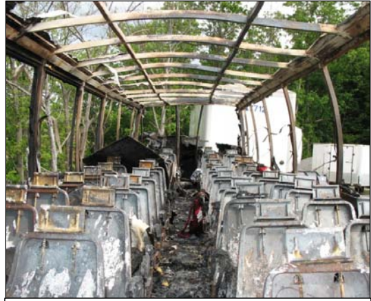
Figure 12: Rear of the interior of the motorcoach.

The aircraft-style overhead storage compartments with top-hinged doors were completely consumed by the fire aft of the C-pillar. The structure of the forward-most overhead compartment remained on either side of the passenger seating area, still mounted to the small section of the remaining roof panels (Figure 13).