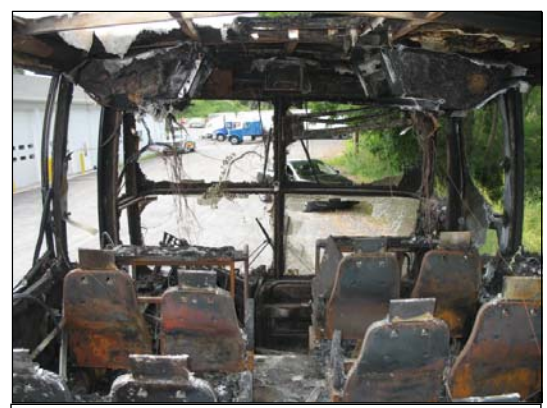
Figure 13: Forward area of the interior of the motorcoach.