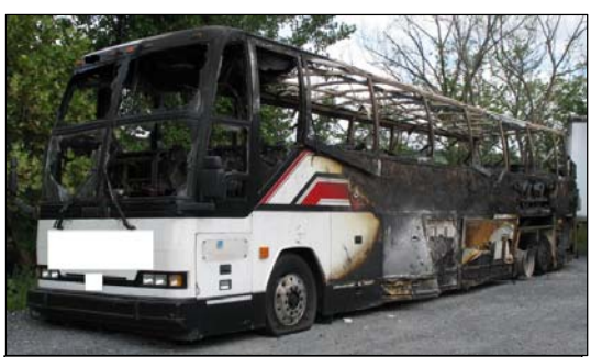
Figure 1: Left front oblique view of the 1998 Prevost motorcoach.

This on-site investigation focused on the origin and severity of a fire that initiated in the rear axle area of a 1998 Prevost Model HS-45 motorcoach (Figure 1). The vehicle was in-transit, occupied by the 53-year-old male driver and 51 passengers, comprised of young adults. The motorcoach was traveling southbound at highway speeds on an interstate roadway when the driver noticed smoke emanating from the right rear of the motorcoach. The driver brought the vehicle to a controlled stop on the right shoulder and attempted to suppress the fire with the