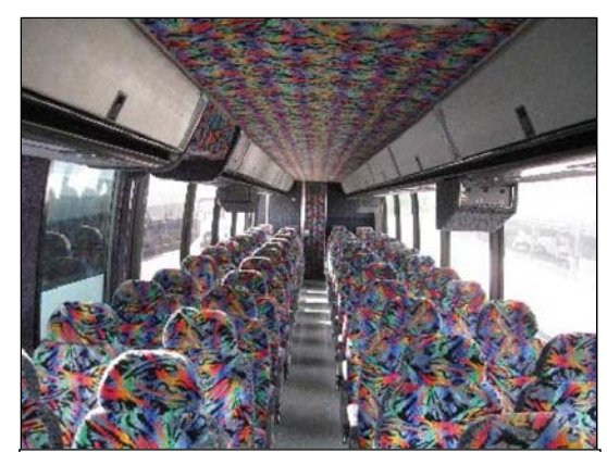
Figure 5: Interior of the passenger compartment of an exemplar Prevost motorcoach.

The back row consisted of two seats on the left side of the motorcoach, adjacent to which was a small lavatory. The lavatory was constructed of plywood walls incorporated into the right rear corner of the motorcoach. These walls and the ceiling of the motorcoach were covered in a synthetic carpet material similar to the fabric covering the seats.