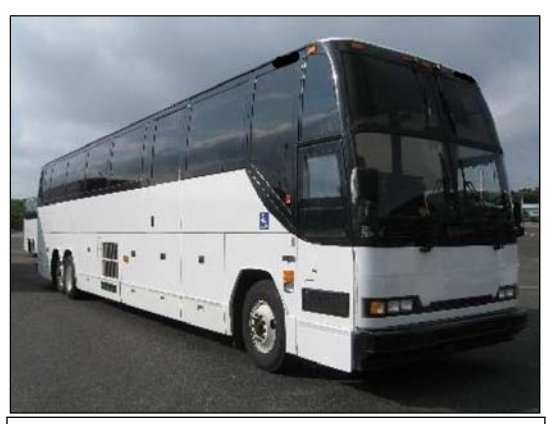
Figure 3: Right front oblique view of an exemplar motorcoach.

The motorcoach involved in this incident was a 1998 Prevost Model H3-45, with a 56-passenger capacity (exclusive of the driver). The motorcoach was identified by the following Vehicle Identification Number (VIN): 2PCH33494W1 (production number The motorcoach was similar to the deleted). exemplar shown in Figure 3. The actual mileage was unknown. The motorcoach was stopped for a roadside inspection in November 2009. inspection involved a Level 3, driver only inspection. The annual safety inspection was conducted in January 2010 at the motorcoach terminal. A single violation was detected that involved an air leak in the left front brake system