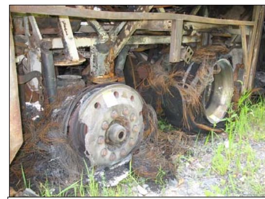
Figure 11: Fire damage to the right rear axle area of the motorcoach.

The fiberglass, plastic, and aluminum components of the body paneling, fascia, and splashguard surrounding the rear axle wheel well were completely consumed by the fire. The rubber of the tag axle tire was consumed. The steel cord from the sidewall and bead was the only remnants of the tire. The tag axle alloy wheel was melted clockwise from the 3-11 o'clock positions, with a hardened pool of melted aluminum at the 6 o'clock position. The rubber sidewalls of both drive axle tires were completely consumed by the fire, which resulted in the separation of the melted tread and collapse of their steel cord structures. The outer alloy wheel was intact with evidence of high heat from the 7-12