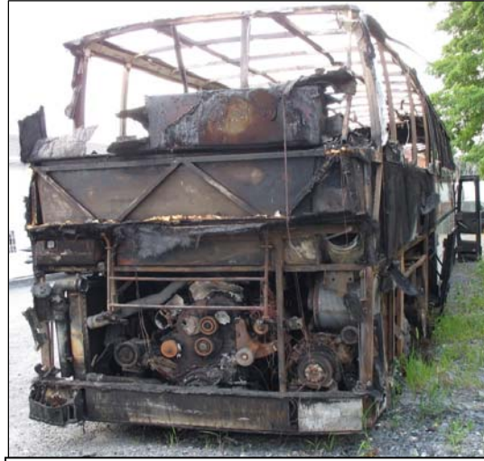
Figure 9: Fire damage to the rear of the motorcoach.

The right side of the motorcoach was burned in a fashion similar to that of the left side, as seen in Figure 10 . Evidence of heat and fire damage was present from the rear corner forward to the approximate midpoint of the motorcoach at the level of the beltline and frame. The engine and battery storage compartment access doors aft of the rear axles were nearly entirely consumed by the fire, with only small sections of melted fiberglass strands remaining at the mounting brackets on the hinges. The batteries and associated components originally located within the compartment immediately aft of the tag axle had been consumed by the fire and were reduced to a cluster of oxidized wire and non-combustible components. Fiberglass and aluminum body paneling above the engine compartment access door at the rear corner were completely consumed, which had created full-exposure of the underlying frame and remnants of vehicle components.