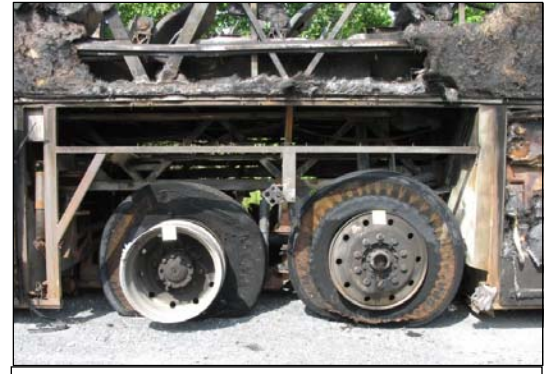
Figure 8: Left rear axle area of the motorcoach.

sidewall, with exposure of the steel cord. A small area of tire tread that had remained in contact with the road surface during the fire was intact and undamaged. This area was rotated 180 degrees from its original 6 o'clock position at the time of SCI inspection, and was attributed to towing and recovery efforts. The tag axle tire was burned to full-thickness on the full circumference of its sidewalls on both sides, with exposure of the steel cord. Combustible rubber and polymer components of the air ride suspension and shock absorbers were consumed by the fire.