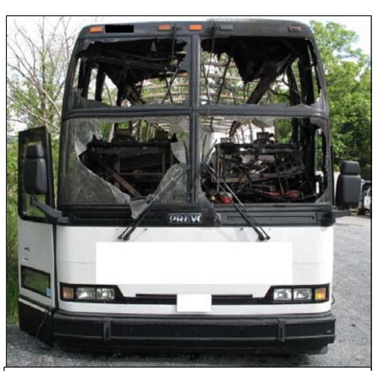
Figure 6: Minor frontal damage to motorcoach.

The front of the motorcoach sustained minor damage (Figure 6). All components below the level of the beltline, including the bumper, bumper fascia, headlight and turn signal assemblies, and body paneling were intact and undamaged. windshield was divided into four quadrants. All four windshield glazing panels had been removed during firefighting activities in an effort to ventilate the interior of the motorcoach and aid in the extinguishment of the fire. Glass and laminate lined the intact gaskets along all four frame edges. There were four wiper blade assemblies for the upper and lower windshields. Both lower wipers were undamaged and remained in the stowed positions. The upper wipers were coated in soot and partially melted from the radiant heat. The left half of the windshield header was soot stained and charred, while the right aspect was intact and undamaged.