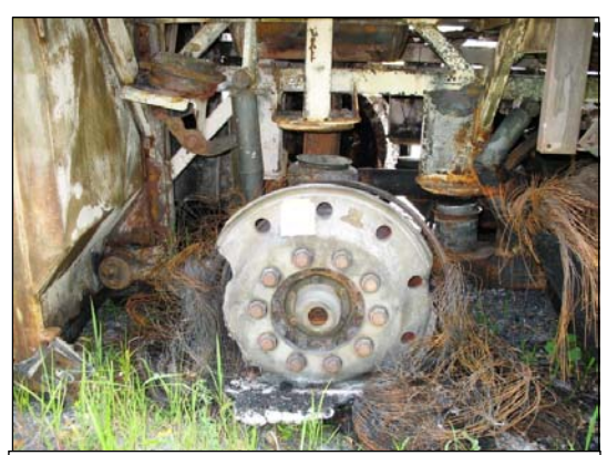
Figure 15: Location of fire origin at right tag axle.

Fire pattern analysis and knowledge of the tendency of fire to progress vertically and horizontally toward sources of fuel, heat, and oxygen were used in identifying the origin of the fire. Based on the overall burn pattern of the fire's progression, the SCI team focused on the right rear area of the motorcoach as the source of the fire's evolution. The SCI team noted evidence of high heat and extensive fire-related damage concentrated within the right rear axle area.