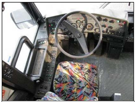
Figure 4: Driver's area in an exemplar Prevost motorcoach.

Passenger seating consisted of 14 rows of four seats, laterally offset in groups of two on either side of the center aisle as seen in the exemplar interior shown in Figure 5 . All seats were of tubular steel construction with foam padding, and covered with a synthetic blend fabric. Each seat was also equipped with a reclining seatback, adjustable head restraint, and a metal footrest.