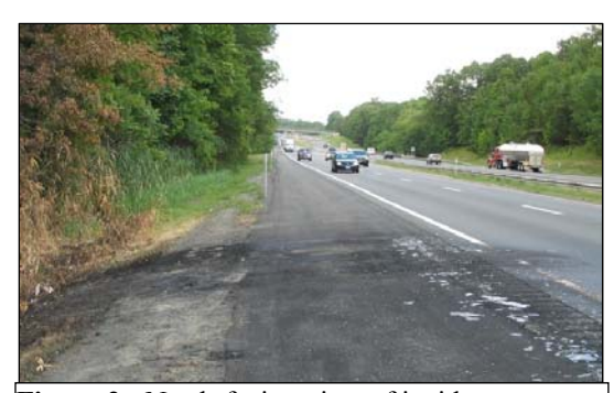
Figure 2: North-facing view of incident scene.

The motorcoach fire occurred on a two-lane physically divided interstate highway with a posted speed of 105 km/h (65 mph). The physical division consisted of a depressed grass median with a W-beam median barrier. The southbound travel lanes were straight with a positive grade of 2 percent. The travel lanes were surfaced with asphalt and were supported by a narrow inboard shoulder and a 3 m (10 ft) outboard shoulder. The inboard shoulder contained a continuous rumble strip and was separated from the inboard travel lane by a single