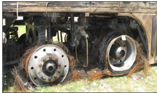
Figure 15. Remaining tire and wheel material at the right rear axle positions.

The outer left drive axle wheel was burned/melted with the bolt pattern area remaining intact. The molten aluminum cooled to a puddle at the bottom aspect of the wheel. Fragments of the tire remained at the bottom of the tread. The inner aluminum wheel at the left drive axle position was completely melted. The inboard left drive axle tire was completely consumed by the fire with the wire bead and steel tread ply remaining. The left tag axle wheel was melted with a minimal amount of wheel remaining at the lower bolt