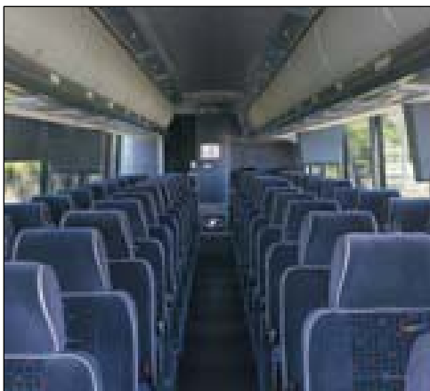
Figure 5. Exemplar interior

Passenger seating consisted of 14 rows of seats ( Figure 5 ). The forward 13 rows consisted of four seats, laterally offset in groups of two on each side of the center aisle. All seats were of tubular steel construction with foam padding, and covered with a synthetic blend fabric. Each seat was also equipped with a reclining seatback, adjustable head restraint, and a metal foot rest. All seats were configured with outboard and common center armrests. As depicted in Figure 6 , the back row consisted of only two seats on the left side of the motorcoach, adjacent to a small lavatory. This onboard lavatory was incorporated into the right rear corner of the motorcoach and was constructed of plywood walls. These walls, as well as the ceiling of the motorcoach and other similar areas, were covered with a synthetic carpet material similar to the fabric on the seats.