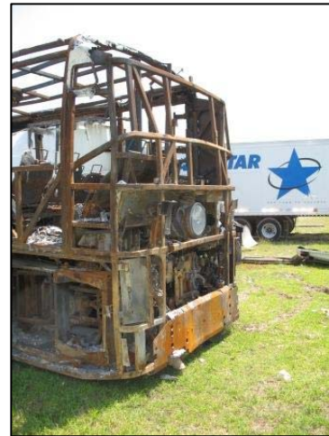
Figure 10. Back plane of the motorcoach.

All of the back mounted components were completely burned by the fire ( Figure 10 ). The composite rear bumper fascia was completely consumed as were all taillight and marker light assemblies. The engine compartment door was fiberglass with a steel frame that was top hinged. The external panel was totally consumed and the door framework was in the open position at the time of the SCI inspection. The upper fiberglass panels above the engine compartment were completely burned with exposure of the structural frame of the motorcoach. This framework was minimally distorted by heat; however, there was no evidence of high heat oxidation.