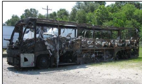
Figure 9. Left side view of the motorcoach.

The left side of the motorcoach sustained extensive damage with near total consumption of all materials excluding the frame ( Figure 9 ). The majority of the exterior body panels and glazing were completely consumed by the fire. The aluminum window frames and the rubber gaskets were completely consumed. The inner panel of the access door at the lower forward portion of the motorcoach remained intact, located between the lower A and B-pillar. This door provided