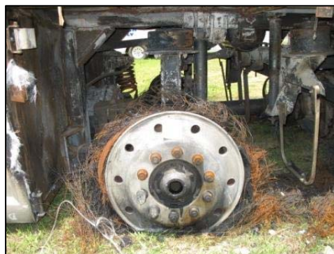
Figure 18. Right tag axle wheel, tire remnants, and the adjacent undercarriage.

The dragging tire mark at the scene extended for an estimated distance of 0.8 km (0.5 miles) and terminated at the burn pattern on the road surface that was the point of rest for the motorcoach. The location of the tire mark on the road surface was consistent with the position of the right tag axle tire.