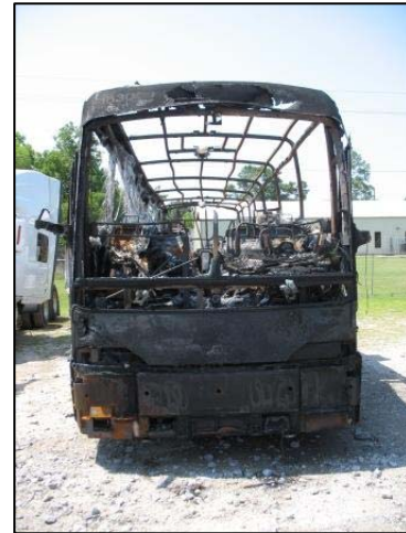
Figure 8. Frontal view of the MCI motorcoach.

All frontal components including the windshield glazing, bumper fascia, and painted surfaces were burned by the fire ( Figure 8 ). The upper fiberglass panel above the windshields was burned full-thickness at the center area and had begun to collapse inward. The outer portions remained intact, although the paint had burned off. In the upper right corner, a portion of the identifying motorcoach number remained discernable. Both windshields were completely consumed. The lower portions of the windshield gaskets were charred, but remained in place. All other sections of the gaskets were completely consumed by the fire. The lower 56 cm (22 in) of the extruded aluminum center divider between the two windshields remained intact. The upper aspect of this support was completely melted. All windshield wiper components were melted. The fiberglass paneling below the windshields was charred but intact. The bumper fascia was completely burned. The structural bumper beam remained intact and was soot covered, but void of all paint. The headlamp, turn signal, and marker light assemblies were completely melted. There was no evidence of high heat in the frontal area of the coach.