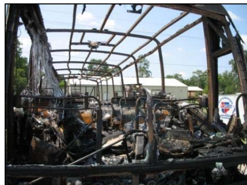
Figure 16. Overall view of the burned interior of the motorcoach.

The fire spread to the interior of the motorcoach and consumed all combustible materials and components ( Figure 16 ). The aircraft-style overhead storage compartments and components were completely burned. The ceiling of the motorcoach was consumed and the plywood floor was completely burned. The seat cushions, fabric and composite armrests were burned. The tubular seat frames remained with all falling rearward as the recline mechanisms released due