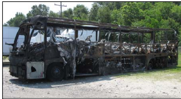
Figure 1. Left side view of involved motorcoach.

Notification of this incident was provided to the Calspan Special Crash Investigations (SCI) team by the Crash Investigations Division (CID) of the National Highway Traffic Safety Administration (NHTSA) on May 12, 2010. The SCI team initiated telephone contact with a staff member of the Federal Motor Carrier Safety Administration (FMCSA) to obtain contact information for the motorcoach company. The Safety Director of the motorcoach company was contacted by the SCI team and cooperation was obtained to inspect the motorcoach and interview the driver. The motorcoach was inspected at the tow facility prior to recycling as it was a total loss. A fire expert reviewed the digital images and the SCI data for this investigation. His review and opinion report relating to fire origin and cause is included as Attachment A of this report.