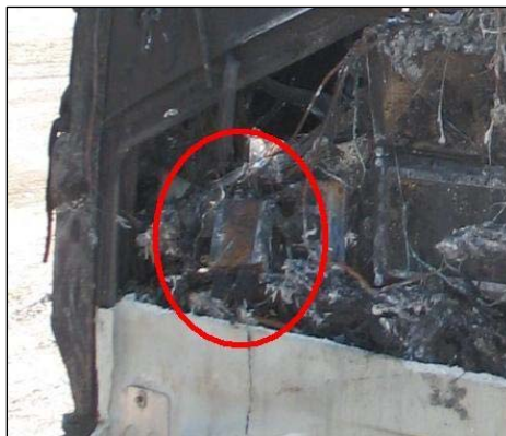
Figure 17. Remnants of the SmarTire receiver

The stainless steel band clamps that retained the sensors in the rear wheels were located at the five of the six wheel positions. The left outboard drive wheel band clamp was found within the remnants of the wheel and tire, though much of it had been consumed and the remainder was bluish in color. No remnants of the left inboard drive wheel band clamp or sensor could be found. Similarly, only a small section of the left tag band clamp remained within the remnants of the wheel and tire.