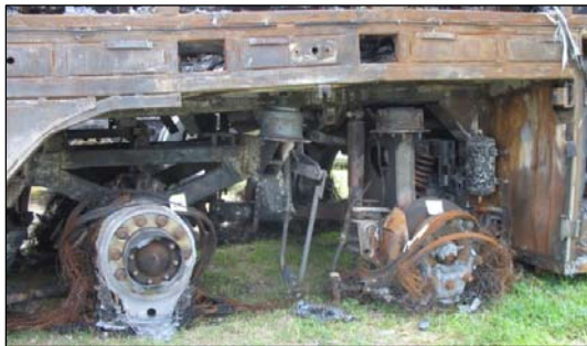
Figure 14. Tire and wheel remains at the left rear axle positions.

The OEM-style aluminum wheels were equipped with a stainless steel trim ring at the bolt pattern and lug nut caps. The left front wheel was blackened by soot; however, the trim ring and lug caps remained intact. The right front wheel was not damaged.