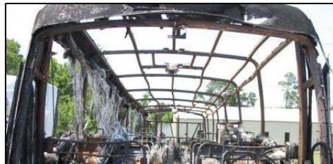
Figure 13. Heat deformation to the lateral and longitudinal roof structure.

The exterior roof of the motorcoach was constructed of aluminum panels with overlap riveted joints at each pillar location. The fire consumed the entire roof, exposing the steel framework. The intensity of the fire warped the lateral roof bows and the longitudinal supports. The most notable damage to the lateral bows occurred between the C- and H-pillars. Extensive deflection of the longitudinal supports was most prevalent between the F- and G-pillars, the area over the rear axle locations ( Figure 13 ). The two plastic emergency roof exits were completely burned.