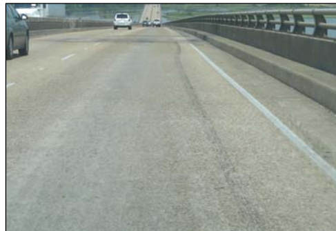
Figure 7. Approach of the motorcoach to the incident site and the right tag axle tire mark.

The motorcoach began its return trip of approximately 1,561 km (970 mi) on the evening prior to this daytime incident. At an average speed of 105 km/h (65 mph), the trip would take approximately 16 hours non-stop. All passengers boarded the motorcoach with small carry-on items and personal belongings, with their larger luggage and musical instruments stowed in the large storage compartments underneath the passenger compartment. After driving approximately 800 km (500 mi) through the night, the motorcoach stopped at a pre-determined location to change drivers. The 63-year-old replacement driver drove the motorcoach approximately 321 km (200 mi) before stopping at a rest/food service area. Following the short duration stop, the driver resumed westbound travel on the interstate roadway. He travelled approximately 206 km (128 mi) and approached the bridge with the construction work zone. The work zone reduced westbound travel to one lane on the approach to the 3 km (2 mi) long high-rise bridge over the waterway. The motorcoach passed through the construction zone and began traveling over the bridge.