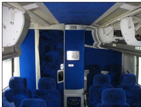
Figure 6. Exemplar rear with lavatory

As seen in the exemplar interior shown in Figures 5 and 6 , aircraft-style overhead storage compartments extended the length of the ceiling area on both sides of the