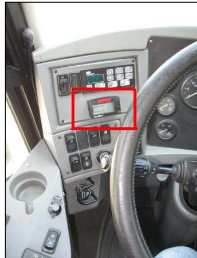
Figure 4. Exemplar SmarTire installation