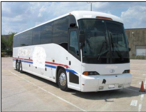
Figure 3. Right front oblique view of an exemplar motorcoach.

The motorcoach involved in this incident was a 2005 MCI Model J4500, with a 55-passenger capacity, inclusive of the driver. The motorcoach was identified by the Vehicle Identification Number (VIN): 2M93JMDA15W (production number deleted), and was similar to the exemplar motorcoach shown in Figure 3 . The motorcoach company reported that the motorcoach was purchased and placed in service on December 9, 2004. The actual mileage is unknown, and no reading could be obtained during the SCI inspection as all components had been consumed by the fire.