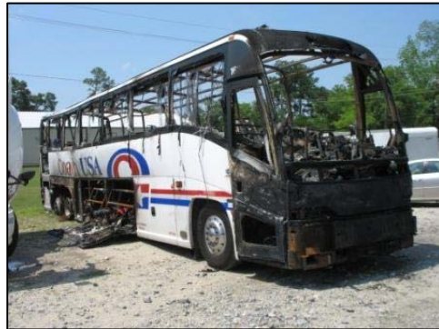
Figure 12. Right side view of the motorcoach.

The right side of the motorcoach sustained extensive damage above the level of the beltline. The body panels below the beltline remained intact with scattered charring and blistering of the painted surfaces ( Figure 12 ). The body panel at the location of the right E-pillar was bowed as a result of partial separation due to heat. All of the glazing panels melted with glass fragments remaining at the corners. The aluminum window frames were predominately intact with scattered melting and distortion of the material. The wheelchair access door to the passenger compartment was completely consumed by the fire. The panel covering the wheelchair lift, that was located below floor level, remained intact. The upper aspect had been broken away by the firefighters during the extinguishment activities. The fiberglass fairing and spray shields above the right rear axle positions were consumed by the fire.