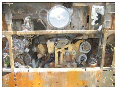
Figure 11. Overall view of the engine compartment.

Within the engine compartment, all belts, hoses, wires, connectors, insulation, and other combustible material were completely consumed by the fire. The fiberglass valve cover was charred and burned through at several locations. The majority of the aluminum components were burned and melted. The mounts to the lower of two alternators had melted and separated. The turbocharger was intact and displayed no evidence of high heat, and the exhaust pipe to the muffler was intact and in place. A normal amount of soot was present inside the exhaust tailpipe. Some paint residue remained on the air intake cover over the engine. Figure 11 is an overall view of the engine compartment.