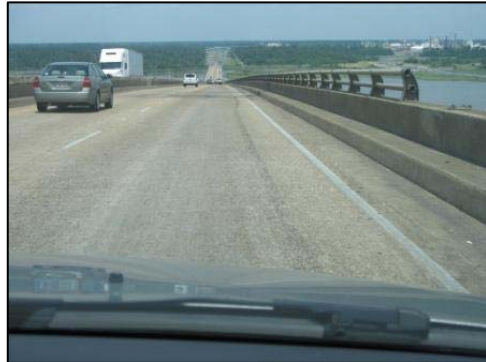
Figure 2. Westbound approach to the incident site.

This incident occurred on a 3 km (2 mi) long, two-lane, asphalt surfaced interstate bridge that extended over a large waterway. In the motorcoach's direction of travel, the bridge initially extended in a westerly direction, elevated and curved right to the north-northwest direction before straightening out at its crest. The high-elevation bridge then remained straight on its down slope as it transitioned to level ground. The travel lanes were bordered by narrow asphalt shoulders and a concrete bridge rail.