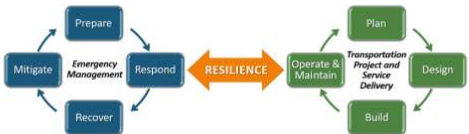
Figure 1. VTrans' integration of emergency management and transportation project and service delivery.

As a VTrans staff member recently said, resilience is the ability to “bounce back” from meteorological hazards such as ice, wind, and rainstorms. Figure 1 illustrates VTrans' approach to integrating emergency management with the transportation planning, programming, and project delivery process.