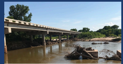
An example of a bridge with large wood storage and an eroding bank.