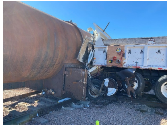
Figure 4. Post-impact Dump Truck and Cabinet

The impact occurred at approximately 43 mph. The track structure supporting the tender and locomotives experienced both tie shift and rail rollover, resulting in derailment of both tender trucks and the B-end trucks of each locomotive. The tender engaged with the rollover inhibitors on both ends and remained upright. The dump truck cab was destroyed, reducing in length from 10.5 feet pre-test to approximately 2 feet post-test. The welds attaching the dump bed's hinges to the truck frame failed, allowing the dump bed to displace forward approximately 20 and 11 inches relative to its original hinge points (i.e., right and left, respectively). Figure 4 shows the post-impact dump truck and cabinet. Note that the cabinet door opened as a result of the impact, however, no piping damage occurred as a result of this behavior.