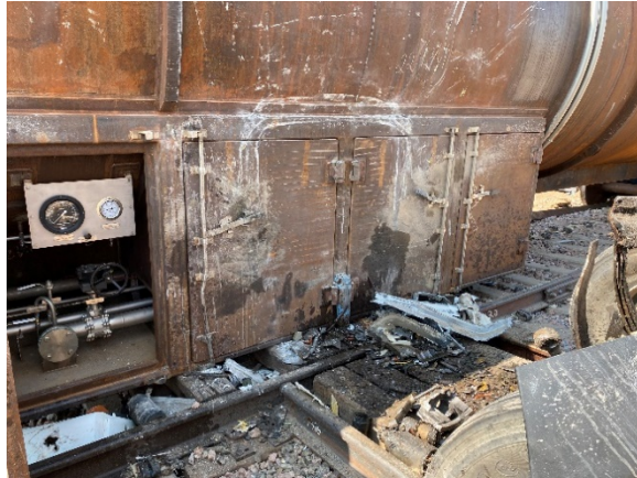
Figure 5. Post-impact Cabinet Following Separation from Dump Truck