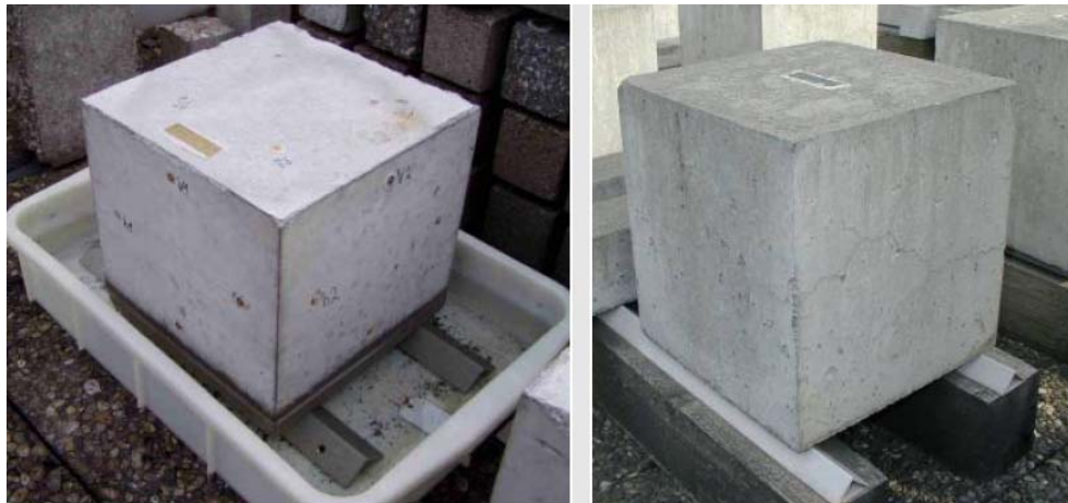
Figure 2. Concrete specimen storage conditions.

Concrete cubes measuring 300 mm (11.81 in) on each side were cast with 440 kg/m 3 (742 lb/yd 3 ) of the RILEM standard cement (CEM I 42.5R), with a water to cement ratio of 0.50 and an air content of 2% by volume. Reference studs were fixed to each specimen in order to obtain field expansion measurements. Select specimens at each site were exposed to ambient conditions, while others were partially submerged in water, as shown in Figure 2, to determine if deterioration would be accelerated. In addition, deicing salts were applied to one set of specimens by storing the cubes beside a highway in Sweden in order to evaluate the influence of external alkalis.