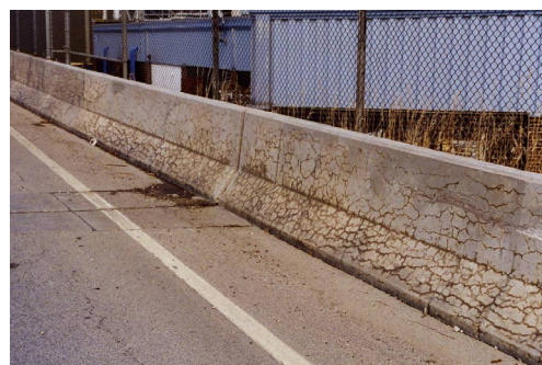
Bridge parapet in Illinois exhibiting ASR cracking 8 years after construction

IDOT's ASR specification is intended to reduce the risk of a deleterious alkali-silica reaction in concrete exposed to humid or wet conditions. Each coarse and fine aggregate, except for limestone and dolomite aggregates, is tested for alkali reaction using American Society for Testing and Materials (ASTM) C1260 for 14 days. Expansion values for limestone and dolomite aggregates are 0.05 % (coarse) and 0.03% (fine). According to IDOT aggregates are considered non-reactive if the ASTM C1260 expansion test result is less than 0.16%. The ASTM C1293 test may be used to evaluate ASTM C1260 test results if a contractor or aggregate producer wants to challenge the ASTM C1260 value, due to its reputation for "false positive" results. (continued on next page)