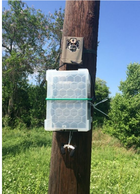
Figure 1. Camera and noise dosimeter.

All students and community members participating in data collection were trained and accompanied by Johns Hopkins Bloomberg School of Public Health faculty on initial site visits. Students and community partners ensured twice-weekly returning visits to the site to collect the SD cards and replace each with an empty SD card to record the next data collection period's CBR traffic.