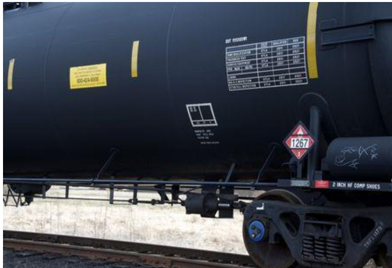
Figure 2. Diamond-shaped hazardous material placard (13).