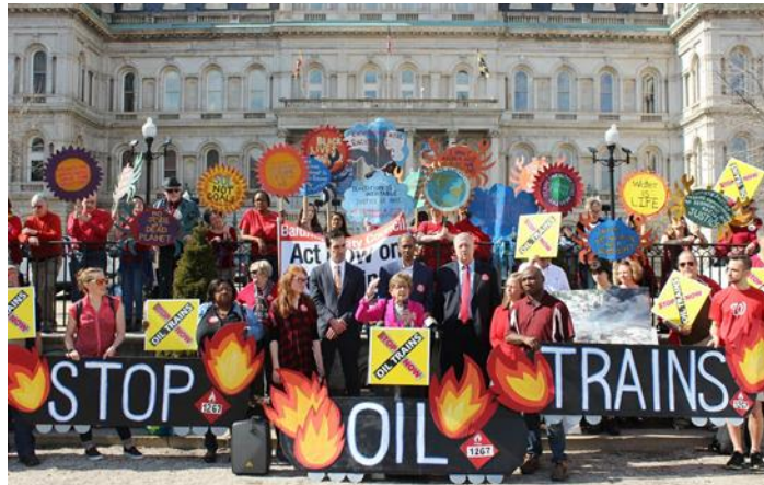
Figure 5. Public pressure generated by community leaders, workers, and researchers against CBR.

With the data and results from this feasibility study, the researchers were able to build proposals for an external funding source on a multi-investigator project to further develop and evaluate interventions to reduce the environmental health challenges associated with oil trains. The researchers have submitted an R01 Research to Action Grant to the National Institutes of Health (PA-19-056) entitled “Pollutant Exposures and Health in Communities Proximal to Rail Lines.”