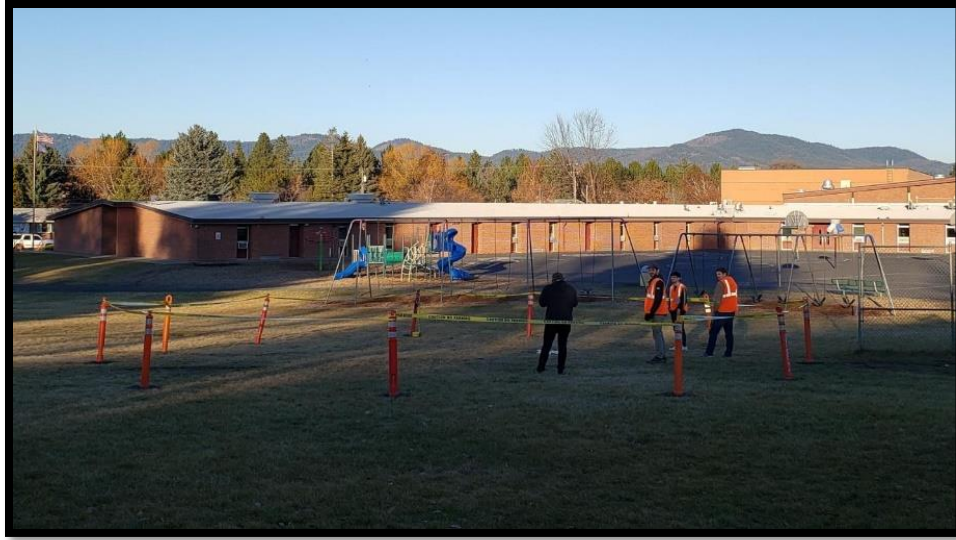
Figure 3 Delineated Drone Flight Area (at McDonald Elementary)

To ensure anonymity of the research subjects, the drone was flown at a height where the closest subject did not exhibit any identifiable features during the video playback; this height was determined through field tests to be at a minimum of 150 feet above ground level (AGL). For this study, all flights were flown at 350 feet so that the drone was sufficiently high enough to capture all key areas of geographic interest.