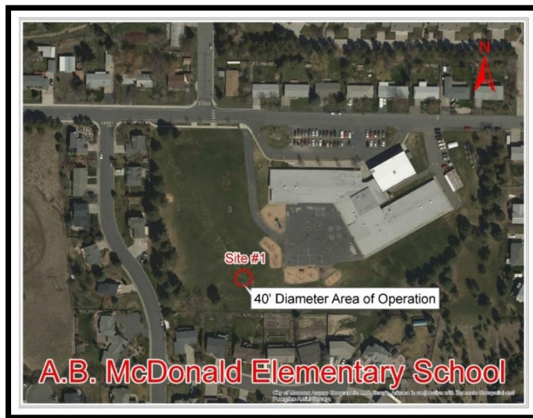
Figure 1 School Site Map Example

To properly illustrate the flight plan, separate maps were created using ArcGIS that showed the proposed flight site location at each school (see Figure 1). Details on each flight site were necessary to illustrate how subject safety would be addressed and demonstrate acceptable FAA methods from the VOs and the pilot-in-command (PIC). An AutoCAD draft of the flight plan was created to show the position, direction, and spatial responsibility of each VO as well as the location of the drone at the flight site. The flight site also included protective measures to prohibit unauthorized persons to be underneath the drone while in flight. With the use of at least twelve candlestick traffic delineators and a roll of caution tape, a physical barrier was created to deter entrance by any subjects. A barrier was shaped in the form of a forty-foot diameter circle with the drone being flown directly in the middle of each site (see Figure 2). The VOs also acted as perimeter crowd control to provide more security at each site.