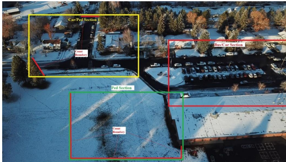
Figure 4 McDonald Elementary Cordon Lines and Boundaries