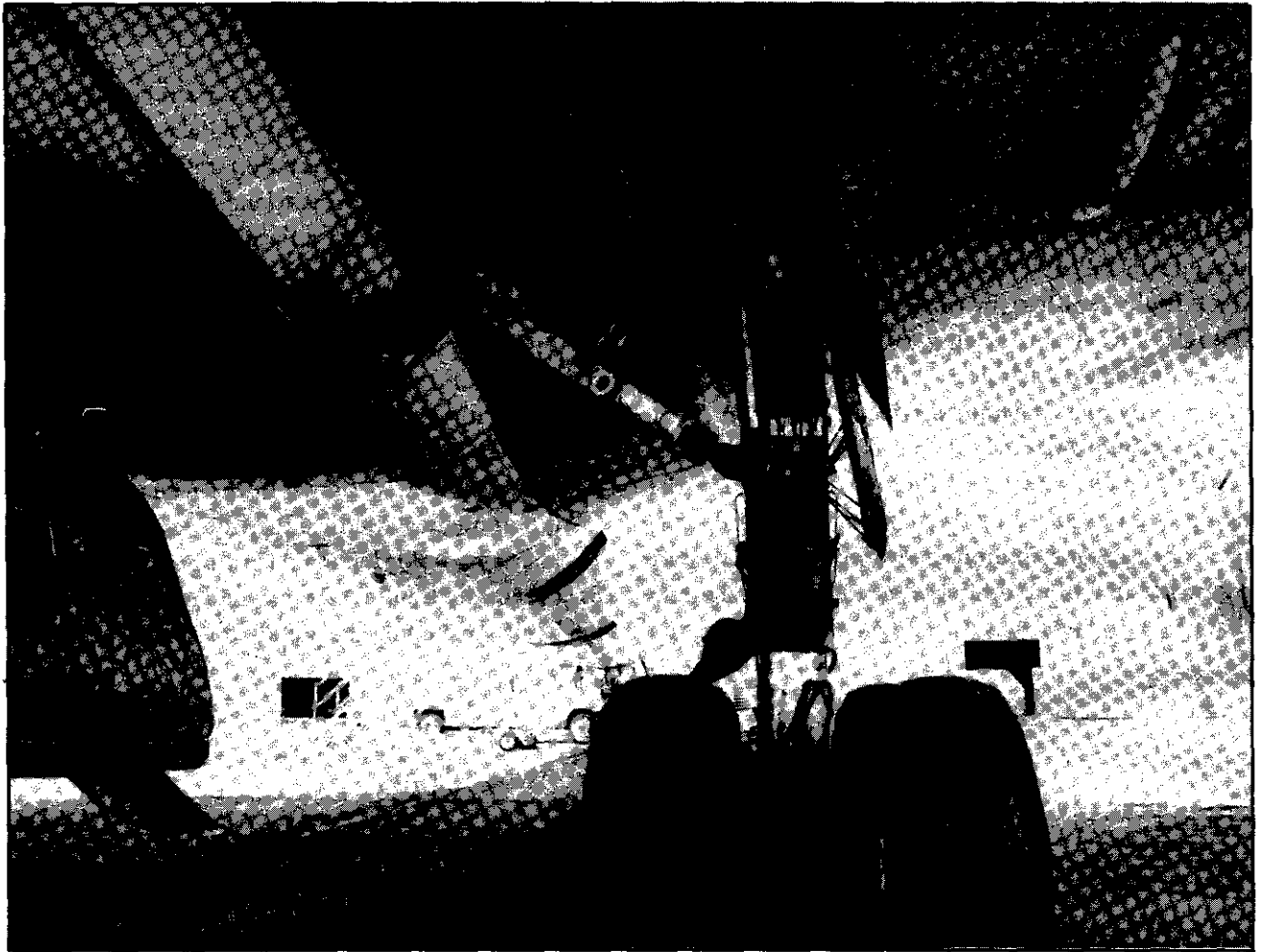
Figure 1. Wheel-Well Passenger Stow-Away Space. it is forward of DC-8 Right Main Landing Gear, Wing Root Area.

When the landing gear retracts in jet aircraft, metal covers close over the opening where the wheel and strut are positioned when the gear is extended, thus reducing in-flight air drag and further securing a stowaway.