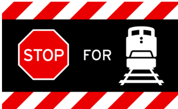
Figure 2. Train Warning Graphic Message