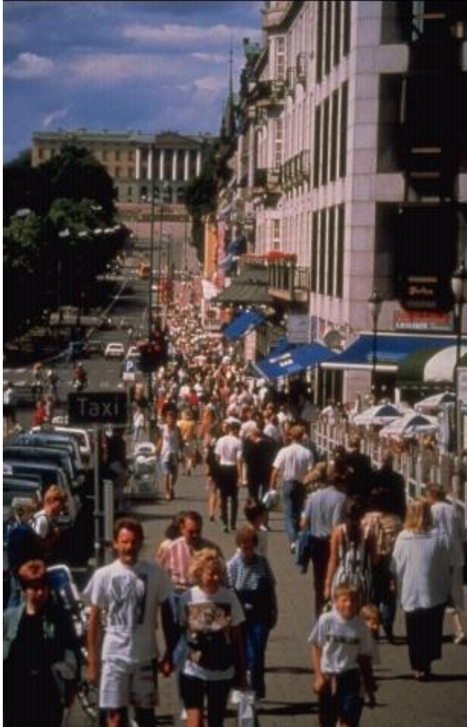
Figure 2.2 Aggregate models can be constructed largely using existing data on population and land use characteristics.