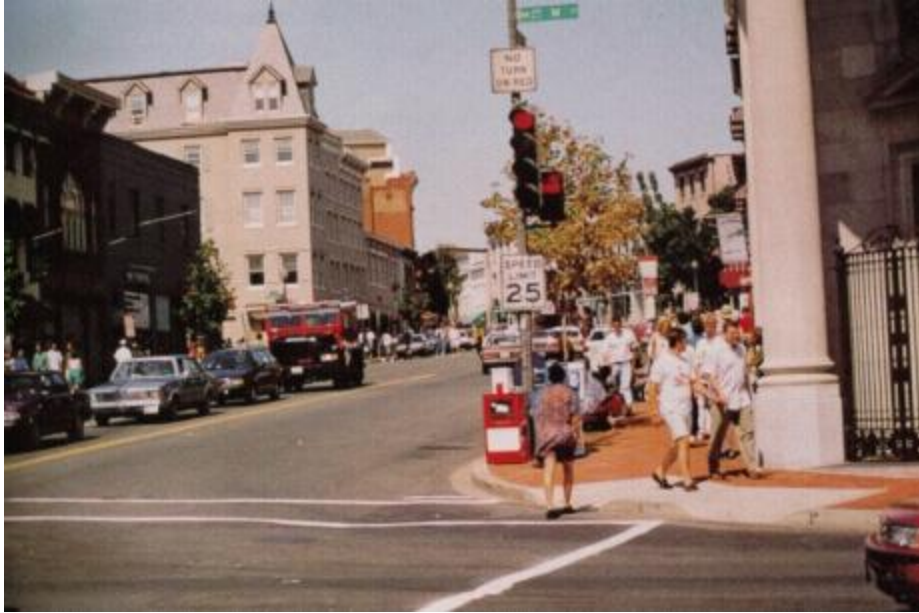
Figure 2.4: Data on surrounding population and employment may be combined with assumed trip generation and mode split rates to estimate levels of pedestrian traffic.