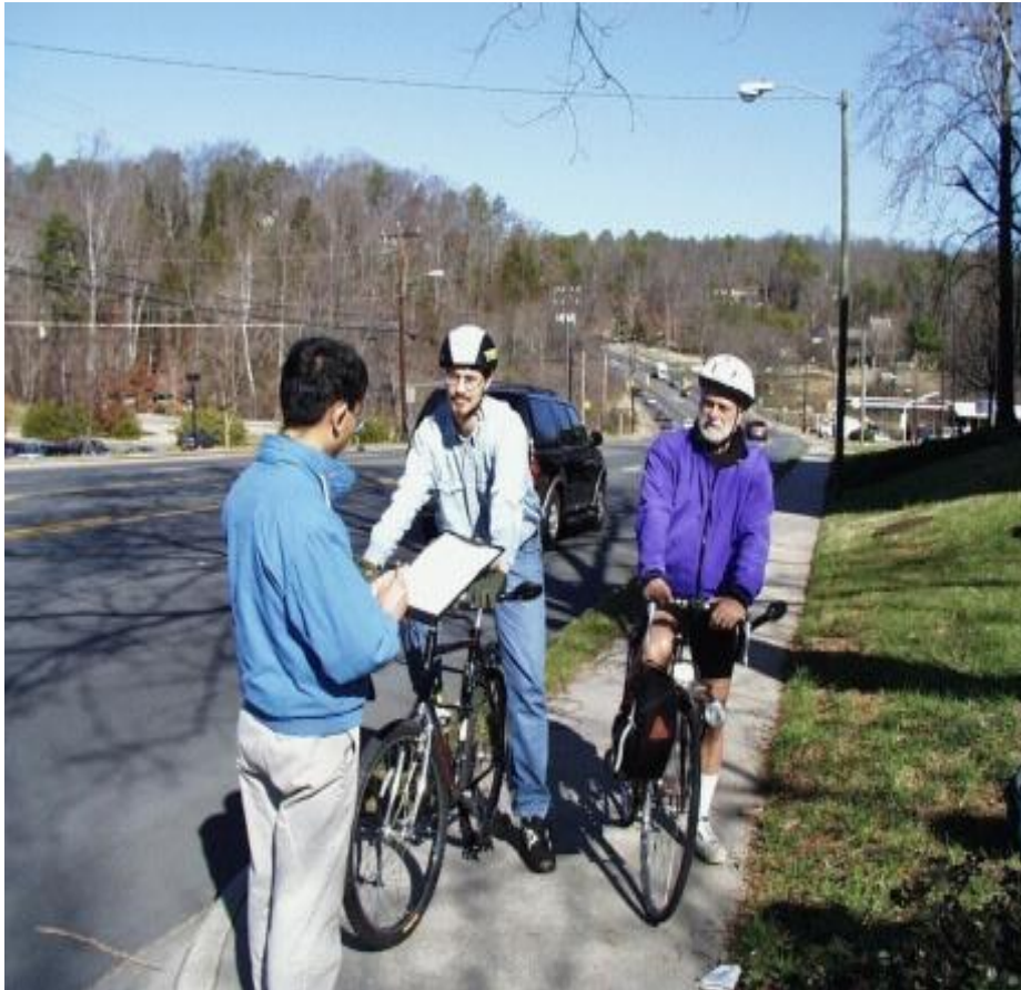
Figure 2.5 In a stated-preference survey, respondents are asked to choose between alternatives with different attributes.

Stated-preference surveys are discussed further under the entry on Preference Surveys.