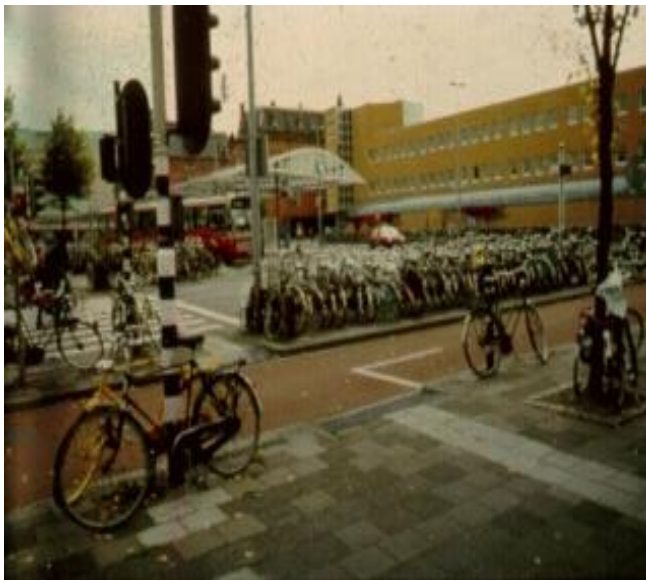
Figure 2.7 Discrete choice modeling can be used to predict bicycle and pedestrian mode share for transit access trips.