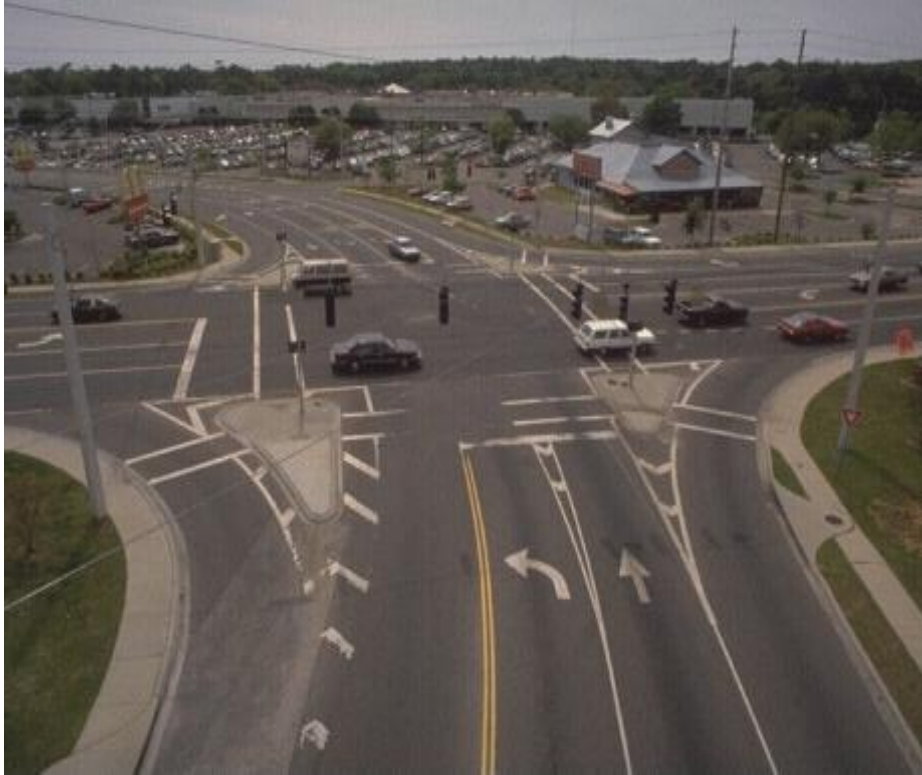
Figure 2.16: Pedestrian compatibility measures describe the suitability of roads, sidewalks, and other pathways for pedestrian travel.

Each primary factor is ranked on a scale of one to five according to its stress level. The stress levels correspond with the LOS measures. For instance, a street segment with a walk area width-volume of "3" would have a LOS of "C."