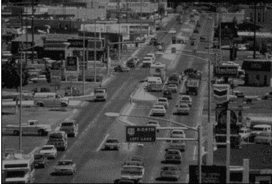
Figure 2.14 The Deficiency Index identifies areas in which the quality of existing pedestrian facilities is low.

The method uses two indices to account for facility design factors: Pedestrian Potential Index and Deficiency Index. The factors considered in each are listed under "Inputs/Data Needs."