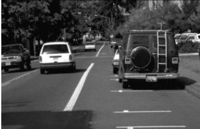
Figure 2.15 The bicycle compatibility index (BCI) allows practitioners to evaluate the capability of a variety of roadways to accommodate both motorists and bicyclists using geometric and operational characteristics such as lane widths, speed, and volume.