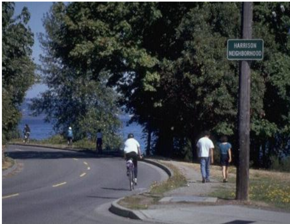
Figure 2.12 A market analysis approach can be used to estimate the maximum potential number of bicycling and walking trips in an area.

This is a general type of approach which estimates the maximum potential number of trips by bicycle or walking, based on: (1) current trip length distributions, usually by trip purpose; (2) rules of thumb on the maximum percentage of bicycling or walking trips by trip distance and purpose; or (3) the percentage of the population likely to switch to bicycling or walking, based on the definition of a target market of bicyclists or walkers according to commute distance, demographic characteristics, etc. An ideal network of facilities is assumed -- i.e., this method estimates how many trips might take place if quality of facilities was not an issue.