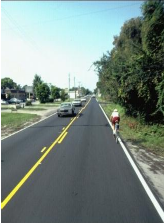
Figure 2.13 The Latent Demand Score method provides a way to estimate the level of travel that would occur if a bicycle facility (such as a paved shoulder or bicycle lane) existed.

The LDS only considers the demand-side for potential bicycle facilities and does not take into consideration the current road conditions. Nevertheless, Landis has developed a supply-side method called the Interaction Hazard Score or IHS Model that would complement the LDS results.