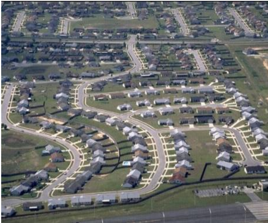
Figure 2.18: GIS can be used to develop network measures (such as street density or connectivity) and land use measures (such as mix or balance) that can be related to the likelihood of walking or bicycling.

The primary outputs of a GIS are: (1) electronic graphic display of thematic layers of data (e.g., road network or population); (2) the printing of thematic maps of the geographic study area; (3) the calculation and assignment of values to geographic areas (e.g., census tracts or traffic analysis zones) based on population, land use, other characteristics; and (4) the calculation and assignment of values to roadway links and nodes (commonly, intersections) based on proximity to trip generator locations and populations, which may become a base for trip assignment in a classic four-step travel demand model.