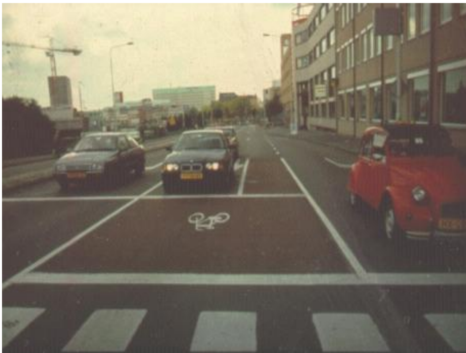
Figure 2.9 A bicycle box at a traffic signal in Groningen, Netherlands. The box allows bicyclists to wait in front of motor vehicles.

Department of Transport. Traffic Advisory Leaflet 8/95: Traffic Models for Bicycling. London, UK, 1995.