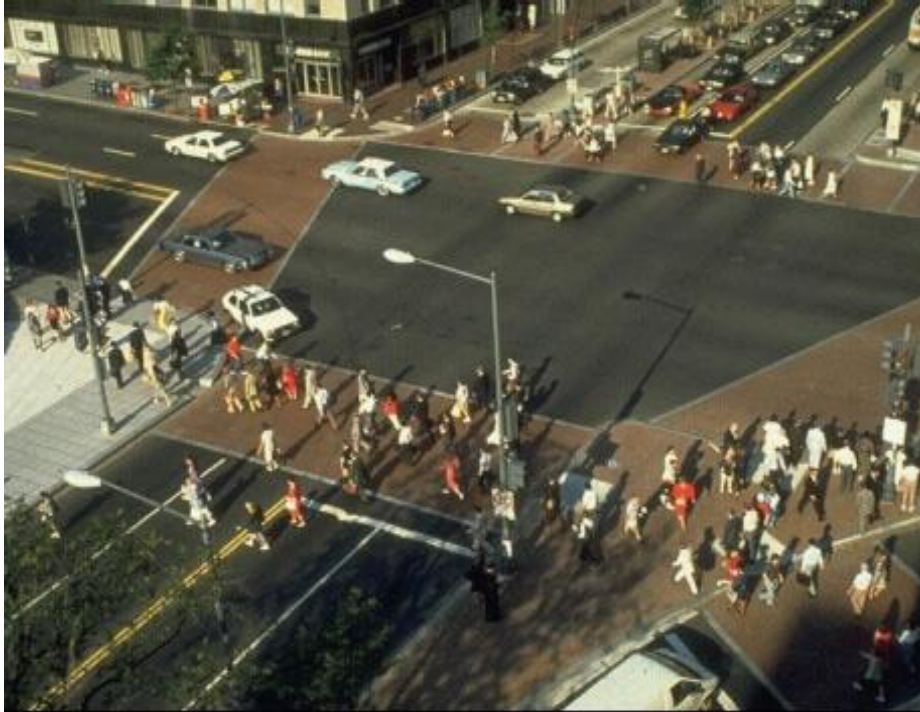
Figure 2.11 The Pedestrian Planning Process manual includes values for trip generation by land use type and by time of day.

Ness, Morrall, and Hutchinson (1969) applied the gravity model technique to forecast pedestrian volume in the Toronto area. The CBD was divided into office zones, and pedestrian links were coded depending on street configuration and the locations of the centroids of these zones. Trip generation and attraction rates were measured for office zones and transportation terminals and were used in conjunction with a set of friction factors and minimum-path walking trees as inputs to the gravity-type distribution model. The minimum path was calibrated on the basis of walking time, waiting time at intersections, street attractiveness, and a turn penalty. (Referenced in Behnam and Patel, 1977.)