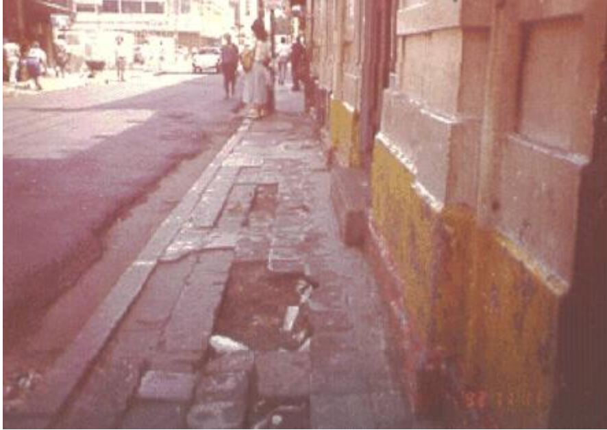
Figure 2.17: Pedestrian environments vary widely in their quality.

Tom Rossi (environment factors in Portland, OR, and Washington, DC): Cambridge Systematics Inc., Cambridge, MA