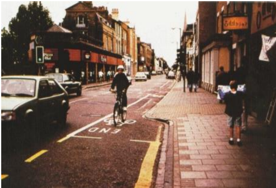
Figure 2.10 A bicycle lane that ends before an intersection.

The output of the START model includes forecast mode shares by zone. The output of the MVCycle model includes forecast p.m.-peak and off-peak bicycle flows by facility/link.