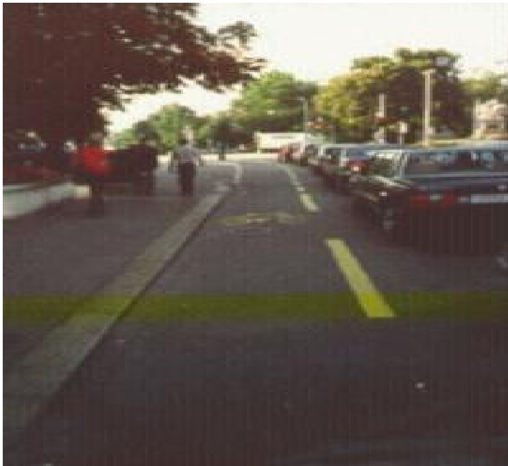
Figure 2.6 What are bicyclists' relative preferences for riding on separate paths or in bicycle lanes?