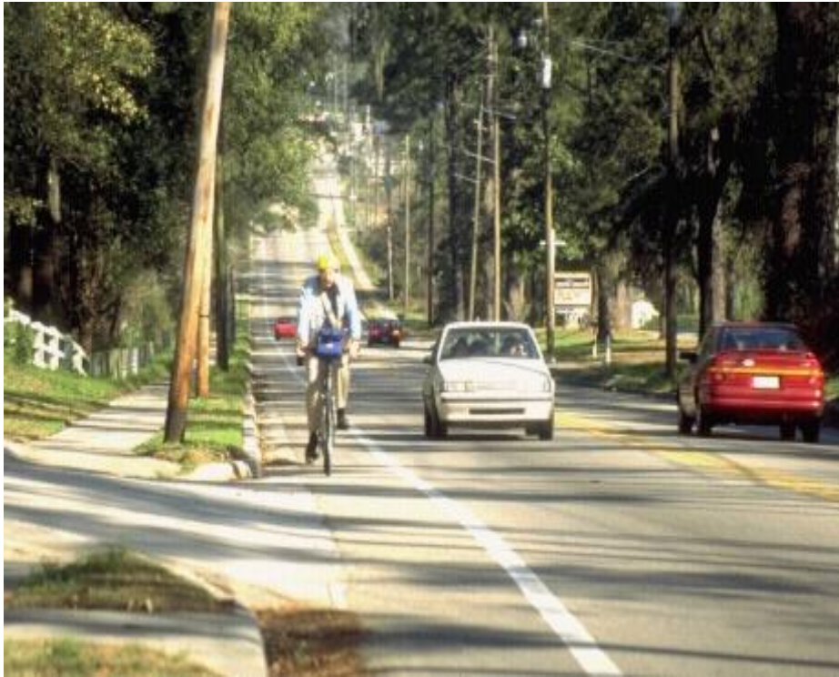
Figure 2.3 A bicycle facility is likely to divert some trips from other modes to bicycling.

Goldsmith, Stuart, Draft: Estimating the Effect of Bicycle Facilities on VMT and Emissions, Seattle Engineering Department, 1997.