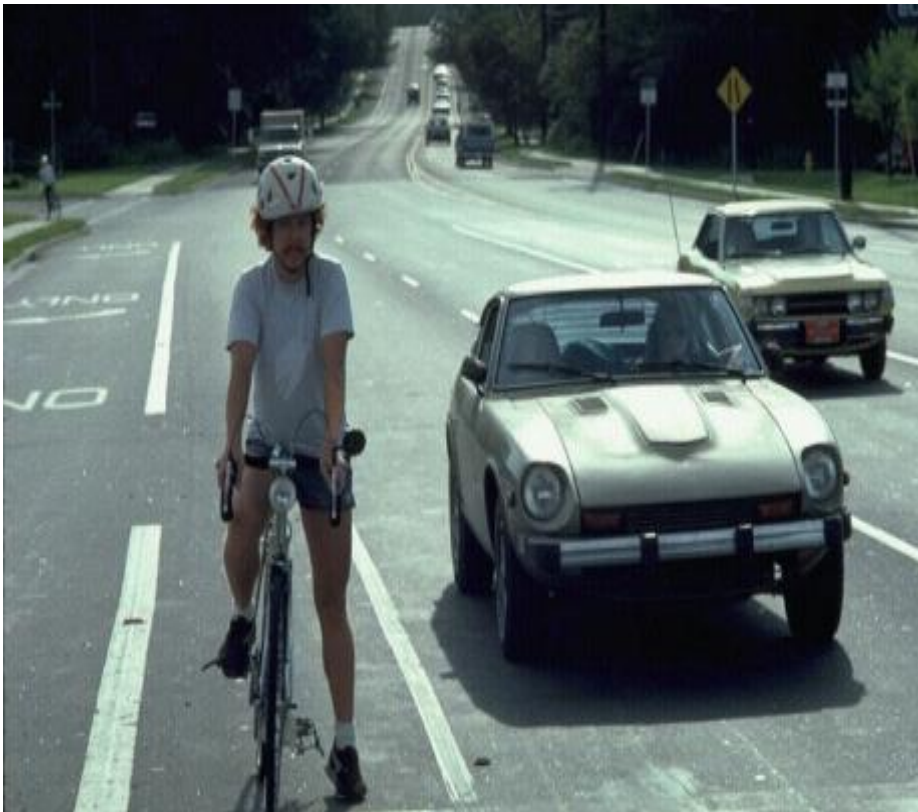
Figure 2.1 A similar conditions study uses data from an existing facility, such as the bike lane shown here, to estimate the potential number of users on a proposed facility.

Lewis/Kirk and Wigan/Richardson/Brunton: This approach requires planners to compare facilities that are similar in type and length.