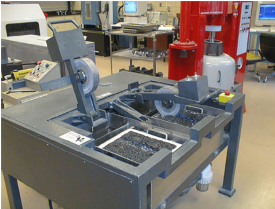
Figure 1. Hamburg WTD without water.