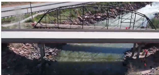
Figure 3. Photo. UAS photo of the Glenwood Springs Bridge.

Some early UAS adopters are moving to the use of cloud services to store UAS inspection imagery and data. For example, Maine DOT, MnDOT, and