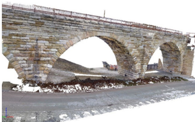
Figure 1. Graphic. MnDOT 3D bridge model.

These models can be shared with interested parties and stakeholders by sending other users a link to access a particular model via the internet.