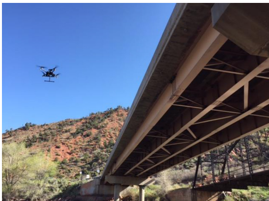
Figure 4. Photo. Glenwood Springs Bridge structure with UAS capturing imagery.