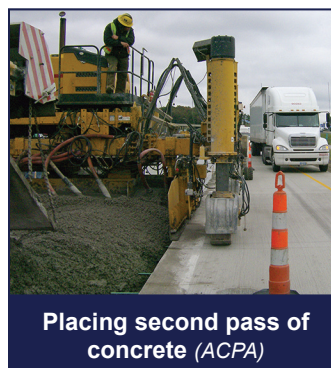
Placing second pass of concrete (ACPA)

A 9-mile stretch of I-44 near Rolla, Missouri, part of the main connector between the Lake of the Ozarks and St. Louis, was in need of resurfacing. With the Lake of the Ozarks being a major recreation and vacation destination, construction-related traffic delays were a major concern; therefore, the contract specified 90 calendar days for completion. Two miles of the project involved milling 11 inches of the existing asphalt pavement and inlaying an 11-inch concrete overlay. Seven miles of the project involved placing an 8-inch unbonded concrete overlay using a geotextile fabric as the separation layer. The contractor paved 219,137 square yards of concrete in 47 days and turned over the project to the State in 66 days.