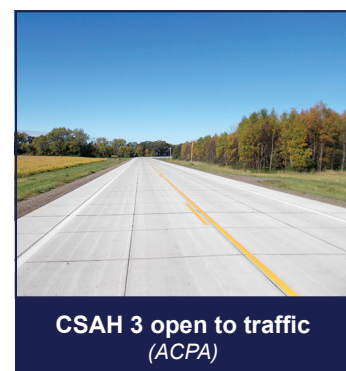
CSAH 3 open to traffic (ACPA)