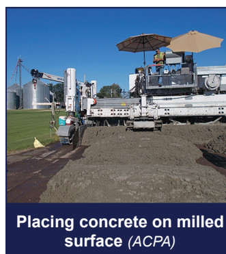
Placing concrete on milled surface (ACPA)

The existing bituminous roadway was 24 feet wide with 8-foot-wide aggregate shoulders. The overlay project involved milling the existing 9-inch asphalt pavement to a designed profile and cross slope to improve the ride and correct deficient superelevation transitions associated with the existing horizontal curves. The concrete overlay design consisted of 6 inches of undoweled plain concrete jointed in 6-by-6-foot panels with a tied shoulder, all of which was placed in a single 32-foot-wide operation.