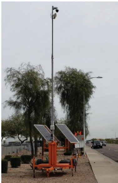
Figure 4. Smart Work Zone equipment with CCTV camera and Roadside Unit

The MC-85 project successfully demonstrated SWZ technology in an arterial setting. During project planning, a concept of operations (ConOps) was developed by MCDOT for the technology systems deployed on both MC-85 and I-10 (figure 4), with dual goals of improving