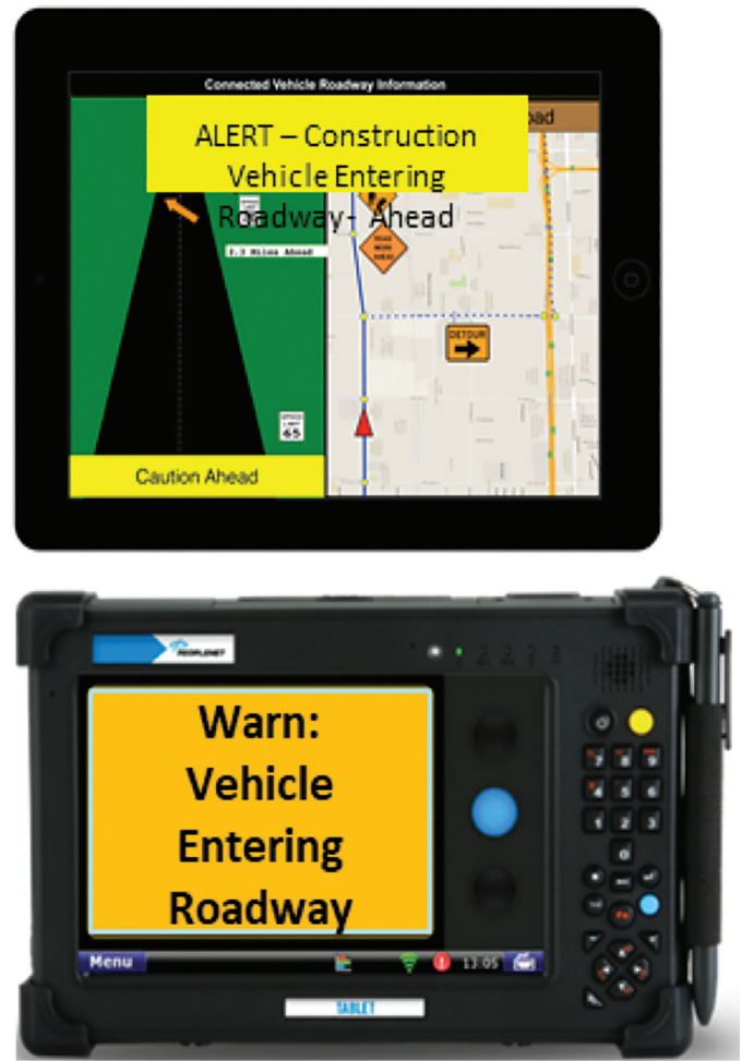
Figure 5. In-vehicle messages provided about the work zone

Solar-powered roadside units (RSUs) were installed by MCDOT throughout the corridor to broadcast information using dedicated short-range communications (DSRC). The solar power is required due to the location of the RSU and a lack of nearby power sources. Information was provided via DSRC through three standard message sets: mapData (MAP) message, Roadside Alert Message (RAM), and Roadside Safety Message (RSM). Information for MAP messages are generated by using the Crash Avoidance Metrics Partnership (CAMP) MAP Tool. The information is used to provide drivers with messages about lane closures, worker presence, and the speed limit, as well as vehicle-specific alerts and warnings about hazardous conditions and excessive driver speeds, as shown in figure 5 and detailed in table 1.