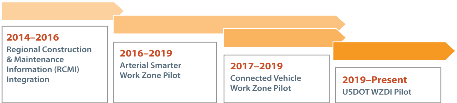
Figure 2. AZTech Work Zone Data Initiatives

However, understanding that some local agencies wanted to use their own data management methods to collect and share data, MCDOT recognized the need for a central repository for data inputs. In 2014, a 2-year Regional Construction Maintenance Information (RCMI) integration effort was launched. This effort resulted in 10 local agencies integrating their local agency arterial roadway construction and maintenance related closure and restriction data into the Regional Archive Data System (RADS). The agencies used a variety of delivery methods, including RSS, GIS, spreadsheets, and TIRC, which facilitates the provision of this information on the Arizona 511 website.