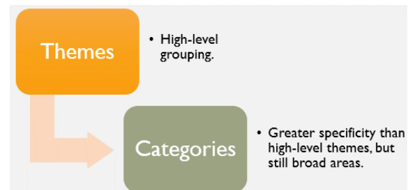
Figure 3. Overview of the data hierarchy

The strengths and gaps in safety culture identified in the reports were reviewed, themed, and coded into a two-level categorical hierarchy (see Figure 3). The prevalence of themes and the categories that comprised them were then estimated by calculating their frequencies across reports. The high-level themes that were identified in these reports closely align with safety culture constructs that have previously been established in the scientific literature. These themes and their measures have further been adapted and used as part of the SCA process (Kidida & Coplen, 2016).