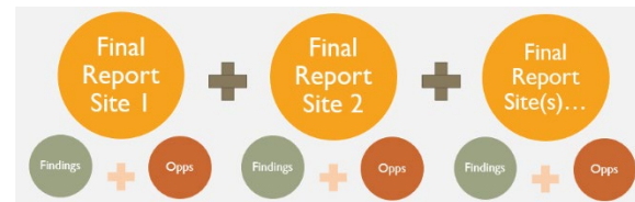
Figure 1. SLSI created nine Assessment Reports in 2020

SLSI uses a multi-method model, which has been recognized as "the most robust assessment model in the industry" by a Volpe National Transportation Systems Center evaluation (Kidada & Howarth, 2019). SLSI's Safety Culture Assessment (SCA) model, which includes interviews, on-site observation, and surveys, continues to provide tangible, action-oriented results for participating railroads.