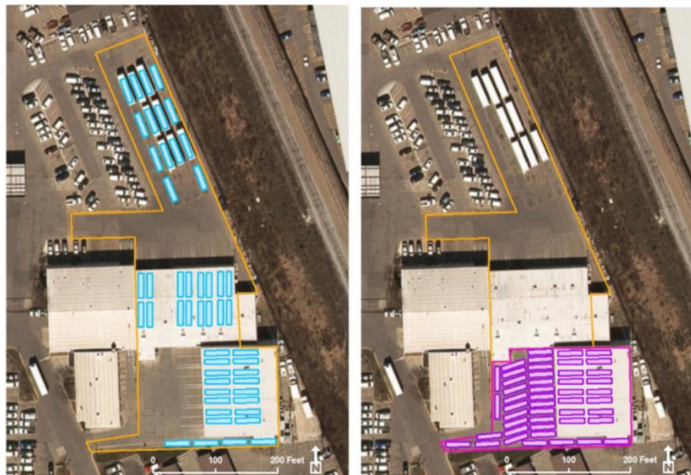
Figures A1 and A2. Example of depot realignment through use of bus automation, with current conditions ( left ) and potential efficient re-configuration of the same rolling stock ( right ).

Automation can address these challenges by allowing for more efficient storage of buses by parking them closer together and automating parking and recall. In its Strategic Transit Automation Research plan document for FTA, Volpe assessed the potential impact both of in operational efficiency and cost savings from yard automation. While the analysis found a significant return on investment for the specific scenario used, it assumed a completely mature technology ready for mass deployment. Cost reductions on a $1 million, 12-year investment for a fleet of 50 buses were estimated at $1.93 million, providing a net savings of $930,000. Volpe did acknowledge that requisite enabling technology was not available on the market at the time of writing, and that yard configurations and operations vary significantly between transit agencies. The report provided an example of more efficient parking configurations enabled through automation, shown in Figures A1 and A2 below.