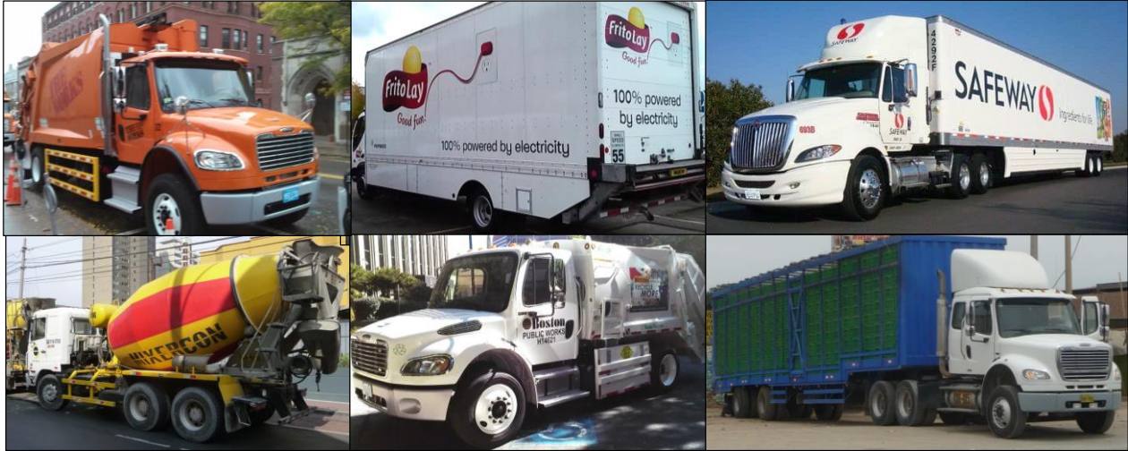
Truck LPDs are shown installed on single-unit as well as combination trucks. At top right, a rigid aerodynamic side skirt installed on a trailer.

Rail-style LPDs designed to protect VRUs cost an average of $847 and add between 6 and 73 pounds to the weight of the truck. VRU lateral protective devices could potentially be built even lighter and still meet the minimum strength requirements of the Volpe specification best practice .