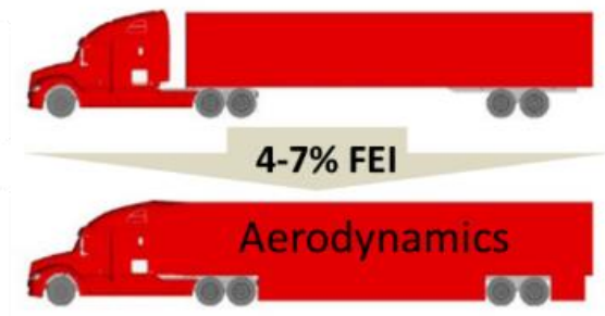
EPA SmartWay has verified that trailer side skirts provide 4-7 percent fuel economy improvement. (Adapted from DOE)

At the same time, aerodynamic truck side skirts (or fairings), which are primarily designed to save fuel for trucks by decreasing air drag but which may also protect VRUs in side-impact collisions, have been voluntarily installed over the last decade on many North American tractor trailers and some straight trucks . This trend is driven by rapid payback from fuel savings and by medium- and heavy-duty vehicle fuel efficiency standards. For a long-haul tractor trailer, the fuel savings from installing a rigid skirt can reach $5,000 per year, or several months to breakeven, depending on mileage and speed. EPA SmartWay has verified that side skirts provide 4 to 7 percent fuel economy improvement.