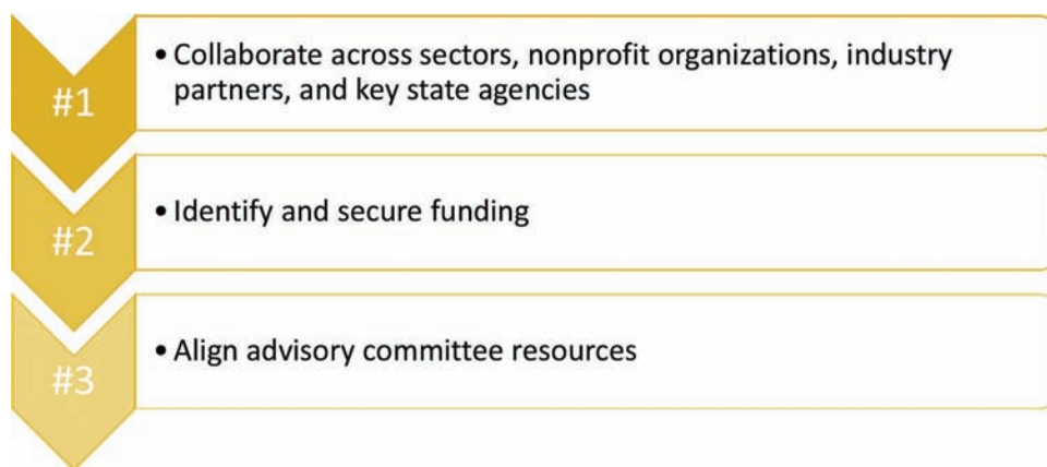
Figure 1.1 Visualization of policies 1–3.