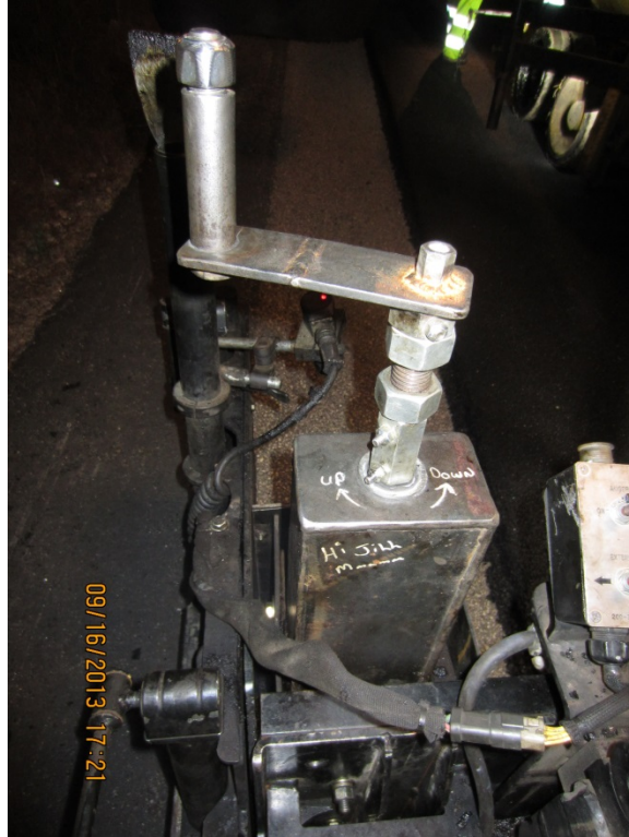
Figure 5. Photo. “Ramp Champ” Safety Edge device being used on the project (top view).