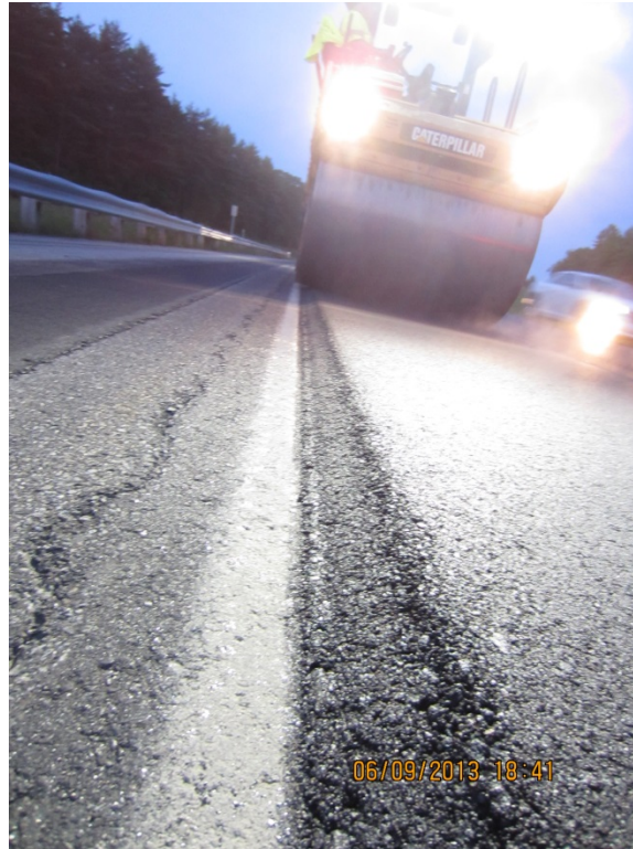
Figure 7. Photo. Compaction of the safety edge.