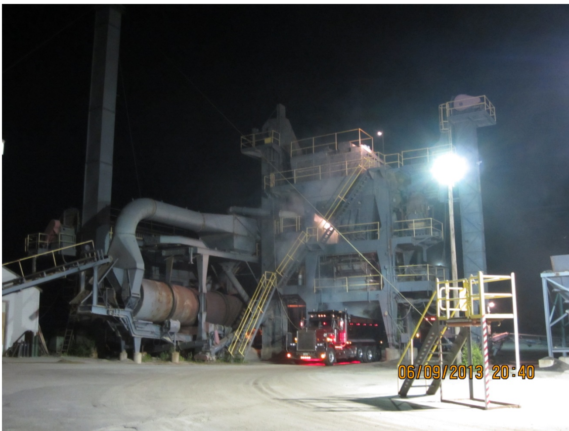
Figure 2. Photo. Asphalt plant used for production of AR and HiMA.

NHDOT's typical surface mixtures include 5.8 percent to 6.2 percent asphalt binder. Although AR binder mix is not permitted in the NHDOT Standard Specification, it was used on this project to promote longevity and prolonged crack resistance. The AR mix, specified at one-half of each barrel for this project, is gap graded with an asphalt cement binder of 7.6 percent, 0.5 percent of which was from the recycled binder. The mix was required to have a minimum of 15.0 percent granulated rubber passing a #16 sieve by weight of total AR binder. The mixture was initially placed without the aid of WMA. However, the WMA technology was also applied to the AR mix to restrict the mix temperature to below 300 °F and to control the strong rubber odors. Figure 2 shows the plant used for the production of the asphalt rubber, and figure 3 shows a picture of the AR wearing course being paved.