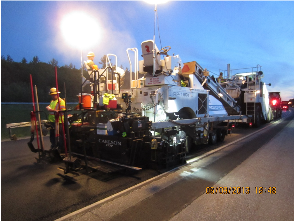
Figure 4. Photo. Placement of the HiMA wearing course.