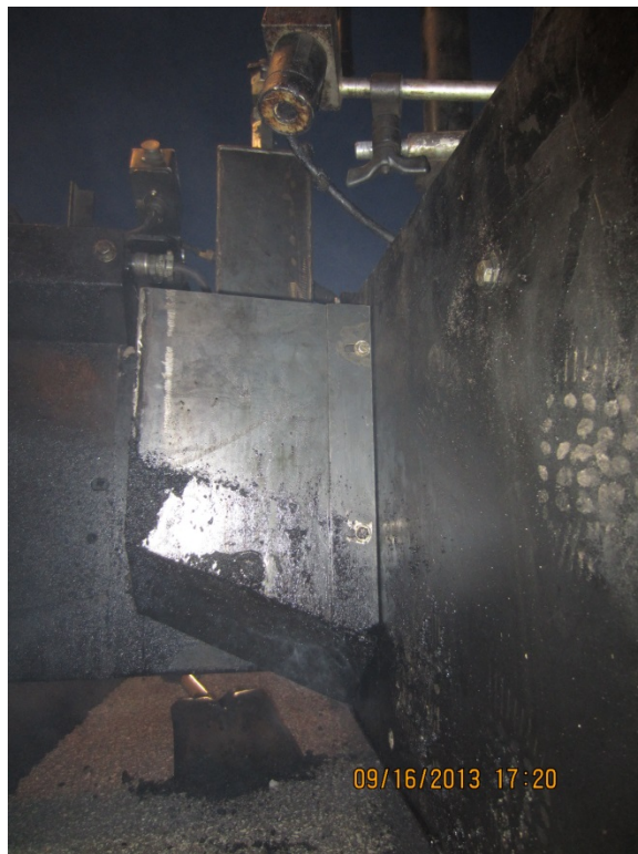
Figure 6. Photo. “Ramp Champ” Safety Edge device being used on the project (elevation view).