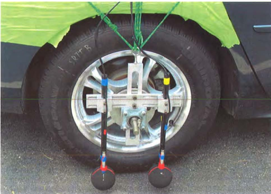
Figure 8. Photo. OBSI dual probe system and the SRTT.

Sound intensity test data were collected before and after construction of the NH Route 101 project, to provide a measure of the sound quality of the finished pavement. Measurements were made using the current accepted OBSI technique AASHTO TP 76-12, which includes dual vertical sound intensity probes and an ASTM-recommended standard reference test tire (SRTT). Data were collected before construction and on the new pavement surface after the road was opened to traffic. Measurements were recorded and analyzed using an onboard computer and data collection system. Figure 8 shows the dual probe instrumentation and the SRTT.