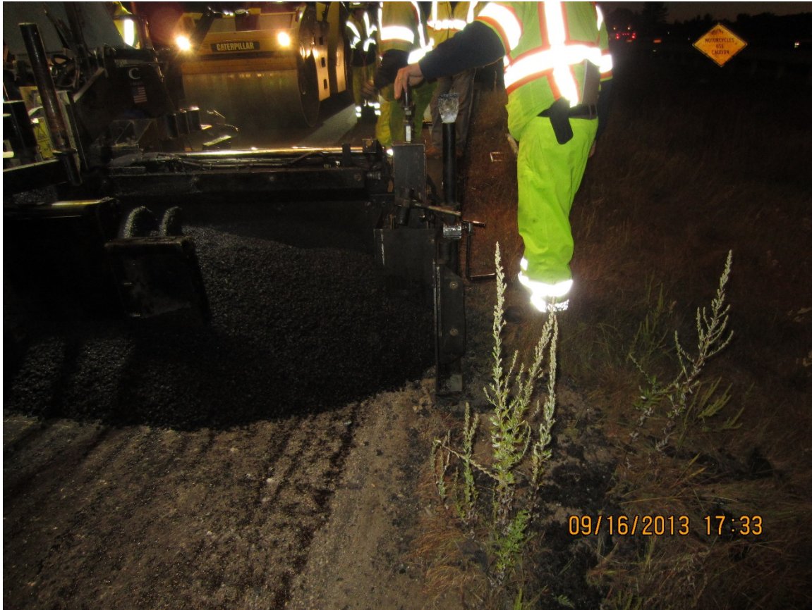
Figure 3. Photo. Placement of the AR wearing course.