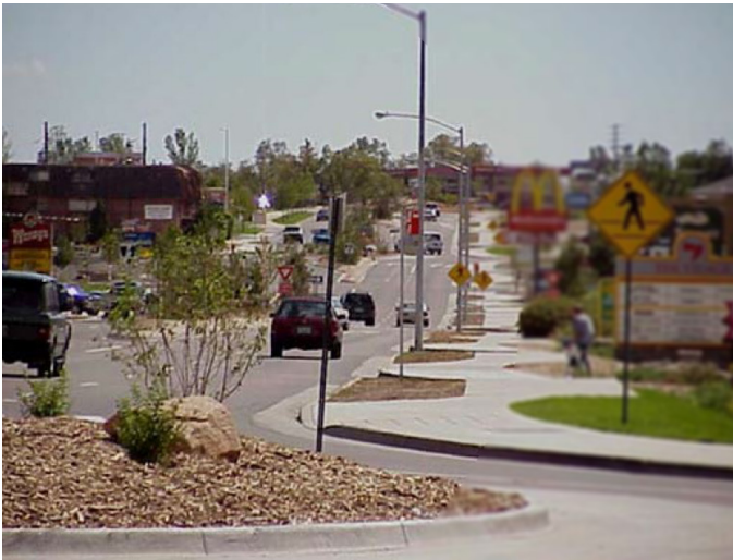
South Golden Road after improvements.