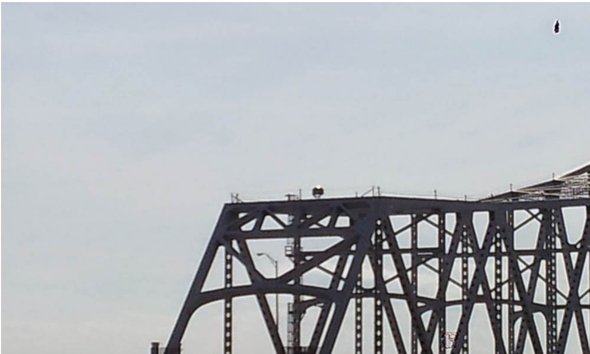
Figure 3. Photo. LADOTD's radar unit mounted on top of the Crescent City Connection Bridge No. 1.