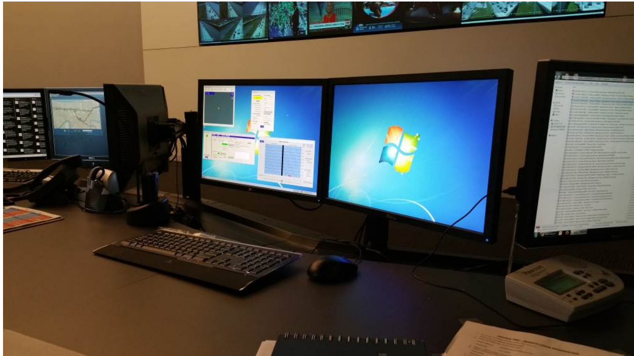
Figure 5. Photo. LADOTD's radar command center.

traffic flow on the approaches to the interchange project area and nearby roadways to the RTMC, notifying the Center of backups on the approaches to the project site.