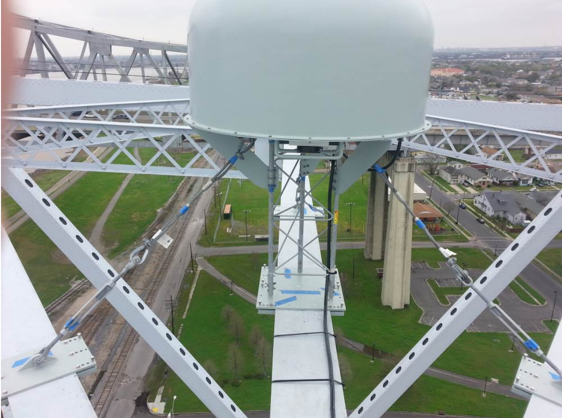
Figure 2. Photo. LADOTD's phased-array Doppler radar.