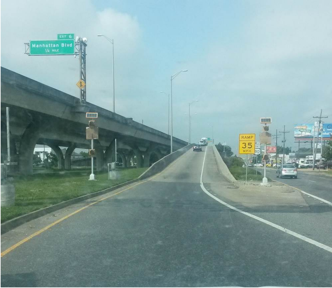
Figure 6. Photo. Foundations and poles for the automated gates.

the capabilities of the RTMC and to remain serviceable for future projects in the metropolitan region within the functional range of the radar site.