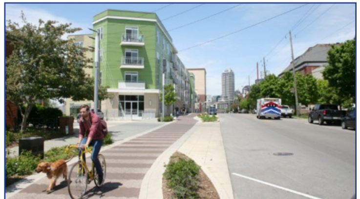
The Indianapolis Cultural Trail street grid road diet brought significant economic development to Virginia Avenue in Indianapolis, IN. The photo at left shows conditions before the road diet and the photo at right shows conditions after.