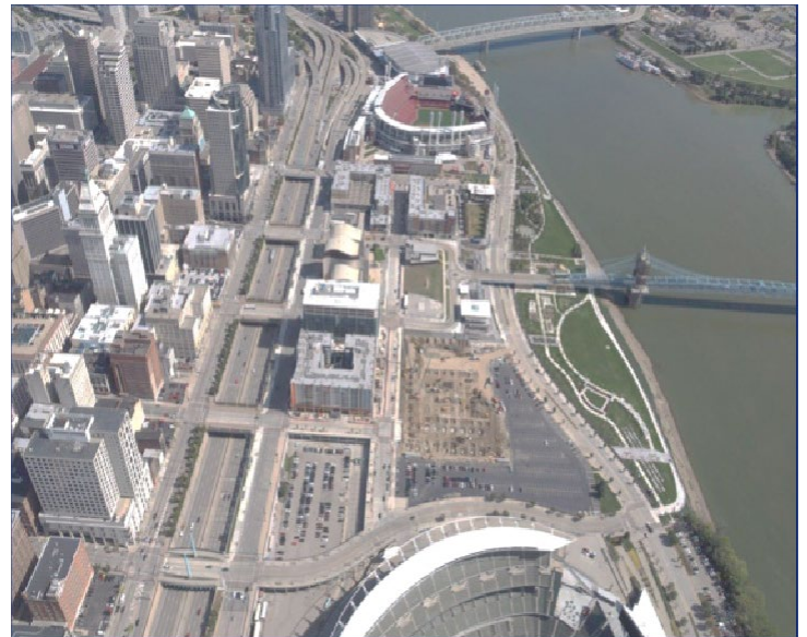
Photo of Fort Washington Way in Cincinnati, OH showing boulevards and cross-freeway connections.