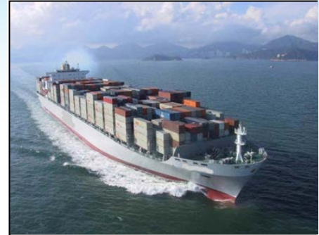
Container ships are a key part of intermodal freight transport. ( www.sharjahairport.net/ )