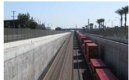
Freight train below-grade crossing on the Alameda Corridor, Source: www.aaroads.com/california/ca-047.html

LA’s Alameda Corridor connects both businesses and communities. The Alameda Corridor is a 20-mile rail cargo expressway between the Port of Long Beach and the City of Los Angeles, including a series of bridges, underpasses, overpasses, and street improvements that separate freight trains from street traffic and passenger trains. The $2.4 billion project includes a 10-mile long submerged central portion, lowering the railway lines to maintain speeds and reduce noise and air pollution. Thirty bridges reconnected communities that were separated by surface tracks. 5 As a result, freight rail movements are more efficient and traffic congestion on surface roadways is reduced because at-grade crossings are eliminated. Improvements along Alameda Street include multiple community revitalization and beautification projects to improve areas along the corridor. Train emissions and noise pollution have been reduced, and emissions from idling automobiles and trucks have decreased.