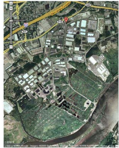
Raritan Center freight village is well located for maritime, roadway, and rail shippers and businesses.

Freight villages support regional economies and community livability. Raritan Center, NJ, is an example of an industrial complex that has evolved into a Community Integrated Freight Village (CIFV) – a freight hub with an emphasis on community-oriented commercial activities. Trucks have convenient access to Interstate 95, a nationally-important truck corridor, helping to reduce truck volumes on most roadways near the site. Rail traffic in Raritan Center grew from 700 cars in 1964 to about 5,000 cars per year in 2007. Rail and marine-based initiatives are being pursued to continue growth, with a plan to rehabilitate an existing waterfront terminal to create “Port Raritan,” which could include an ethanol barge/ship-to-rail transfer facility. This will make the freight village multimodal and expand the center’s economic benefits to the area. The complex has a variety of commercial facilities, such as retail shops, restaurants, cafes, and non-freight office buildings used by local businesses. These make Raritan Center a valuable economic contributor to adjacent towns, while helping to buffer the industrial center from residential areas, lowering the impact of industry and shipping on residents. 4