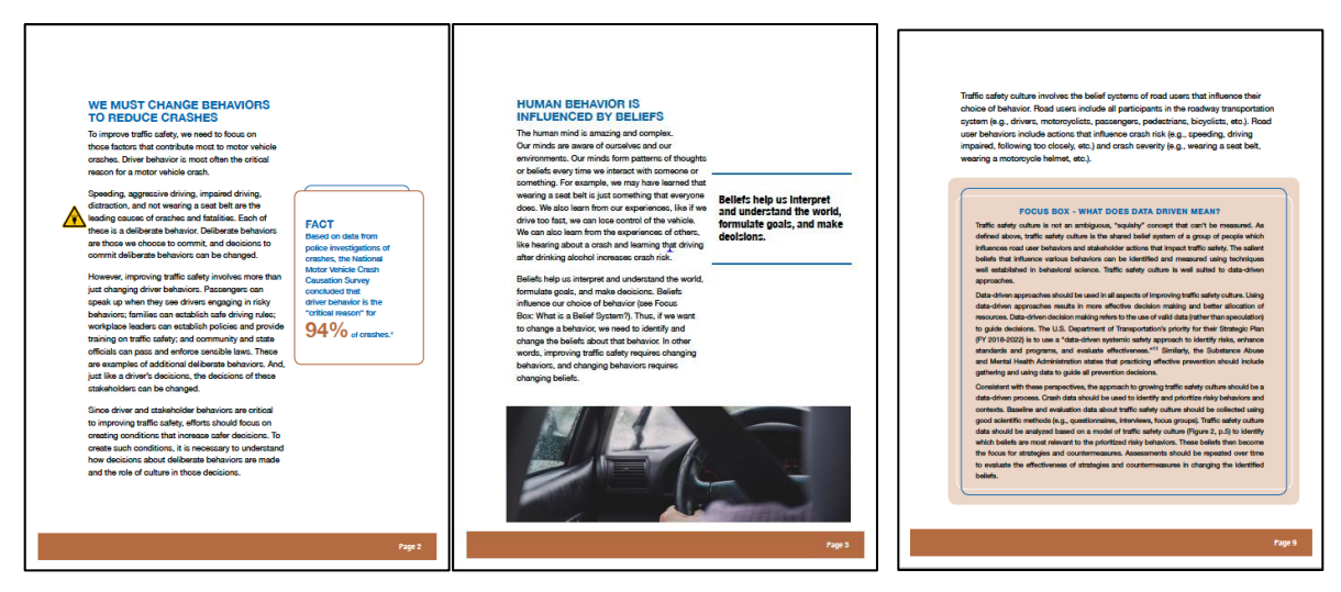
Figure 2. Examples of (a) icon to identify key information and separate statistics from main text, (b) repeat (highlight) key sentences, and (c) provide more detailed information for reader in separate section.

The style chosen for the layout and format of the primer was intended to make the content approachable (not intimidating) and accessible (easy to find). As shown in Figure 2, several design methods were used to meet these design goals including using an icon to identify key information (Figure 2a), separating relevant statistics from the main text (Figure 2a), repeating (highlighting) key sentences (Figure 2b), and providing separate sections for more detailed information (Figure 2c).