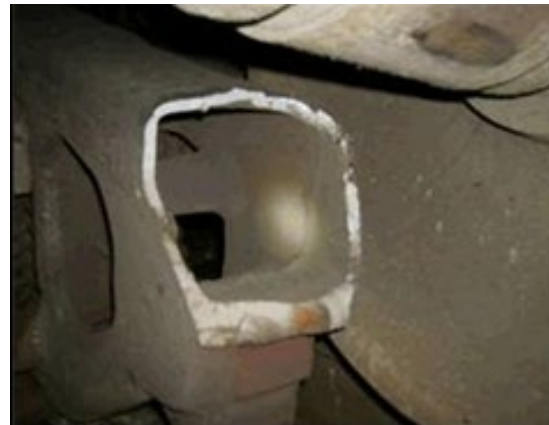
Figure 3. Fractured side frame