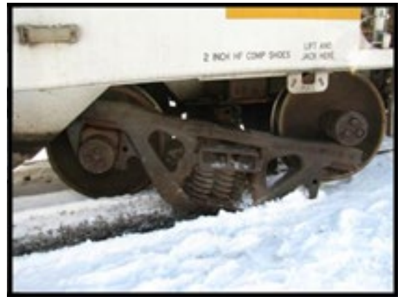
Figure 2. Broken side frame that led to derailment in winter

A Technical Advisory Group (TAG) was formed for this project, consisting of metallurgists from railroads, a truck casting supplier, a consulting company, a university, and from TTCI. The findings of the TAG led to the results in this report.