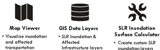
Figure 2: Icons depicting functions of the Sea Level Scenario Sketch Planning Tool