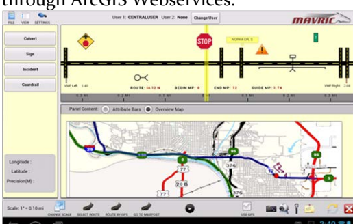
Figure 1. MAVRIC interface showing signs, culverts and guardrail features along the road network.

The web portion of the prototype, Road Analyzer, allows for basic reporting by managers in an office environment. The final application will have a web reporting component, a dashboard allowing users to render data in different ways, and a close to live stream of data available in a web portal through ArcGIS Webservices.