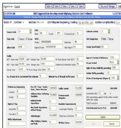
Figure 4. Editing screenshot of ADHS Cost Estimate Table B.

Finally, the application stores and archives ADHS-related documents and data in a repository for anyone who needs them and supports coordination among multiple agencies.