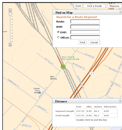
Screen capture from the Stimulus Viewer

With guidance from the DOT GIS Administrator, three IT staff (all with GIS backgrounds) developed the framework and the Stimulus Viewer. The framework was developed in the fall and winter of 2008-2009. The Stimulus Viewer was built in the last week of January 2009 and refined over the first two weeks of February 2009. Most of the refinements were data-related.