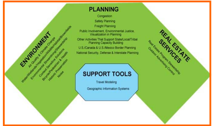
The diagram above illustrates how STEP's Proposed FY 2010 emphasis areas are grouped

The FHWA issued a Federal Register notice on September 4, 2009 soliciting suggested lines of research for the proposed FY 2010 STEP. To provide your feedback, please visit the STEP Web site and review the draft FY 2010 STEP Implementation Strategy. www.fhwa.dot.gov/hep/step/resources/federal_register/fr04se09106.cfm .