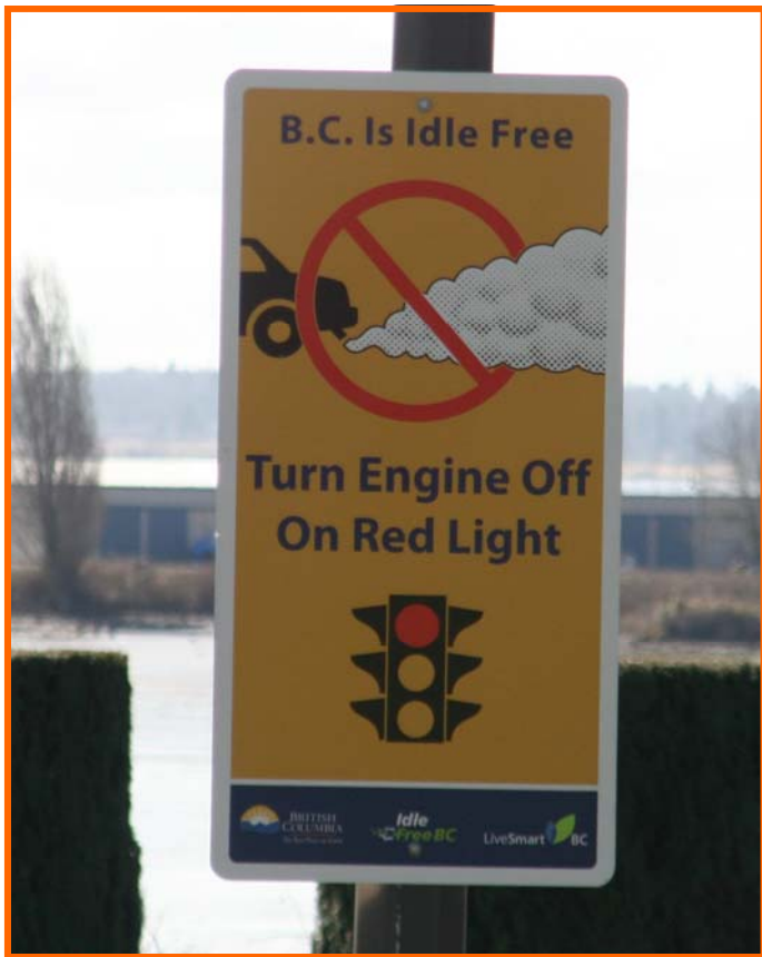
Informational sign educating motorists to turn off their car engines on the Canadian side of the Peace Arch Port of Entry.

The system consists of a new traffic signal and signal-control system, with the signal cycling in response to inputs from pre-existing loop detectors (part of the border wait-time ATIS system) installed within approach lanes to the border. The signal is installed about 250 meters upstream of the U.S. Customs inspection booths, and there are two sets of loop detectors between the signal and the booths. When stopped traffic is present over the loop detectors immediately downstream of the signal, the light turns red, stopping upstream traffic. In theory, all cars upstream of the signal turn off their engines during the red light cycle, while cars downstream of the signal