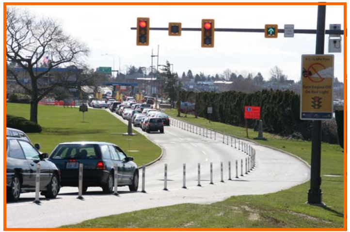
Cars with their engines off waiting for the green light at the Peace Arch Port of Entry on the British Columbia side of the border in March, 2009.

At the request of the B.C. Ministry of Transportation, the Border Policy Research Institute fielded a team of students in July 2009 to observe operation of the system.