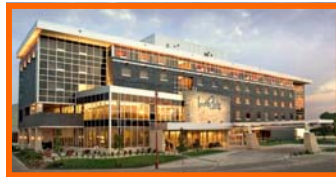
Inn at the Forks Hotel, Winnipeg, Manitoba

Originally an aboriginal meeting place, the Forks has been the site of numerous encounters over the past 6,000 years and now attracts over four million visitors each year. It encompasses an interpretive park, revitalized historic and new buildings and offers a host of year round outdoor and indoor attractions.