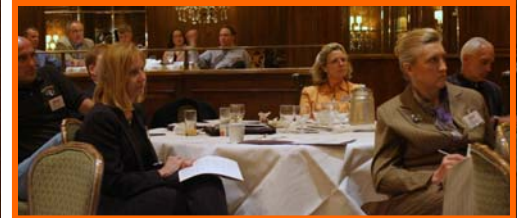
TBWG members during one of the many sessions