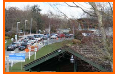
Traffic waiting to enter Canada at the Peace Arch Port of Entry

To facilitate the safe and secure movement of goods and people across the U.S. and Canada land border crossings, a Border Wait Time (BWT) working group comprised of U.S. Customs and Border Protection (CBP), Federal Highway Administration (FHWA), Canada Border Services Agency (CBSA), and Transport Canada (TC) are working together to foster the use of technologies for automating the measurement and dissemination of wait times at U.S. - Canada land border crossings. The BWT working group is in collaboration on various wait time measurement initiatives to include testing and evaluation of border wait time measurement technologies and the implementation of solutions that meet cross border operational needs.