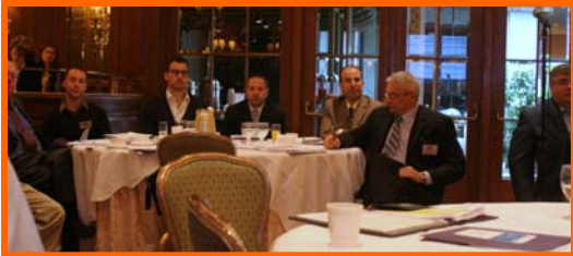
TBWG members during one of the many sessions