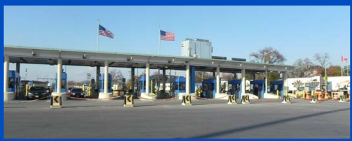
The photo above shows the passenger vehicle processing pill boxes at the Peace Bridge Port of Entry. TBWG Participants were given a walking tour of the facility.