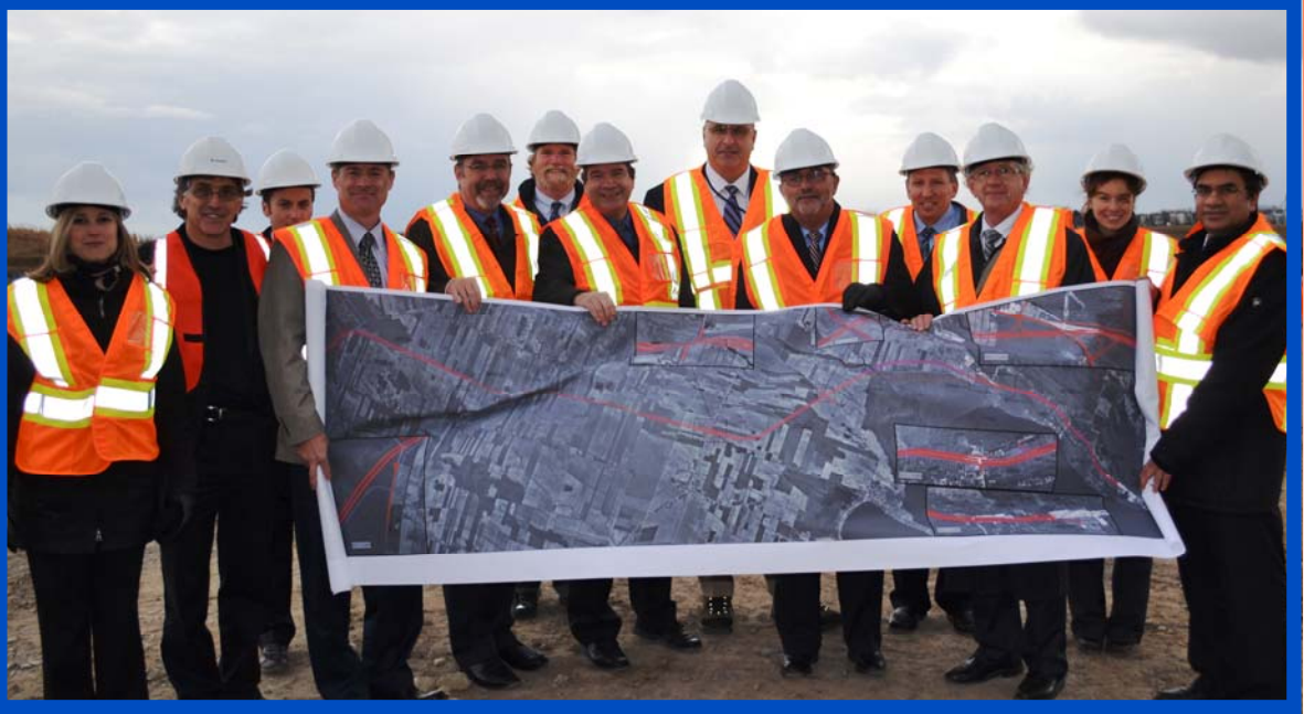
The photograph was taken near the MTQ project that will extend autoroute 35 between Saint-Jean-sur-Richelieu and Saint-Armand at the Vermont border.