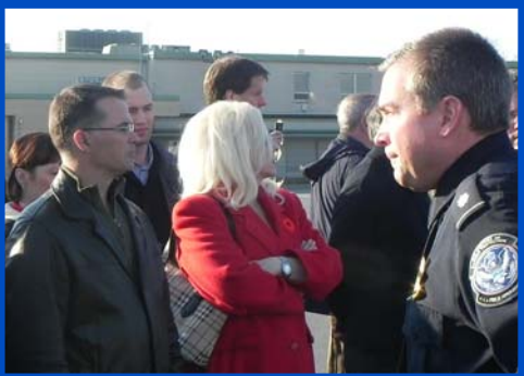
TBWG Participants looking over the tarmac at the Peace Bridge Port of Entry.