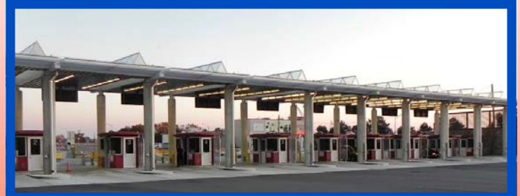
The Queenston Port of Entry was the second stop on the bus tour. Shown above was the passenger vehicle processing pill boxes that were recently constructed.