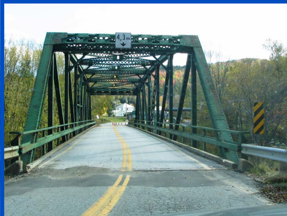
The bridge pictured above is the Sutton—East Richford Bridge. Collaboration between Québec's MTQ and Vermont's VTrans to reconstruct this bridge were discussed during the November 17th meeting.

work for which Transport Canada provides financial support. Once finished, this stretch of more than 37.9 kilometres (23.5 miles) will complete the expressway link between Montréal and Boston. MTQ engineers indicated that construction of the expressway, which began in 2009, could be completed (and open to traffic) around 2017. In summary, both the MTQ and VTrans expect that, in addition to improving traffic flow and road safety in the axis of autoroute 35 and Interstate 89, the new expressway will improve the overall efficiency of the transportation system and movement logistics between Québec and New England. More than a million vehicles, 20% of which are trucks, use this border crossing each year to cross the Canada-US border.