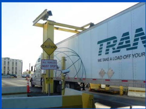
A tractor trailer is processed through the Peace Bridge Port of Entry during the TBWG bus tour.