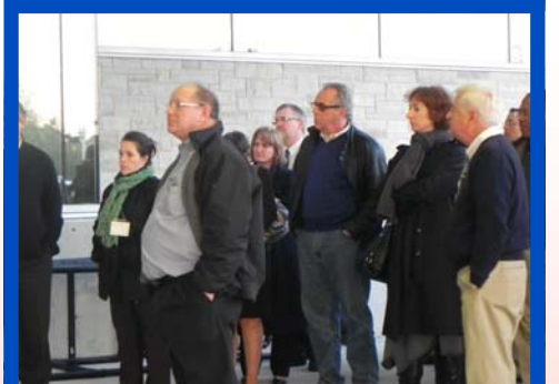
TBWG Participants carefully listening in during the bus tour of the Queenston Port of Entry.