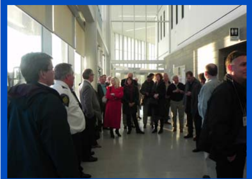
TBWG Participants were given a walk through of the recently completed CBSA facilities at the Queenston Port of Entry.