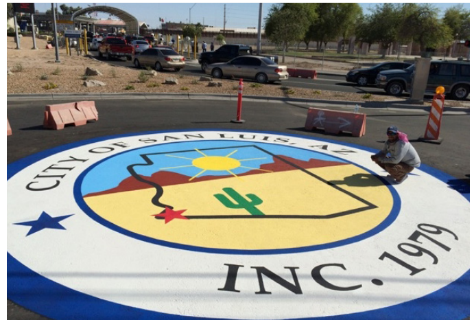
Artwork located near the San Luis Port of Entry in San Luis, Arizona.

FHWA also facilitates the development and maintenance of the surface transportation system along the U.S.–Mexico border to address existing and anticipated demand for cross border travel and trade while working with federal, state, regional, and local agencies, and private sector interests. In 2016, 400,000 trucks , 8.8 million personal vehicles , and 16.9 million vehicle passengers crossed through the eight Land Ports of Entry (LPOEs) along Arizona's 389 miles of shared border with the state of Sonora, Mexico. 1