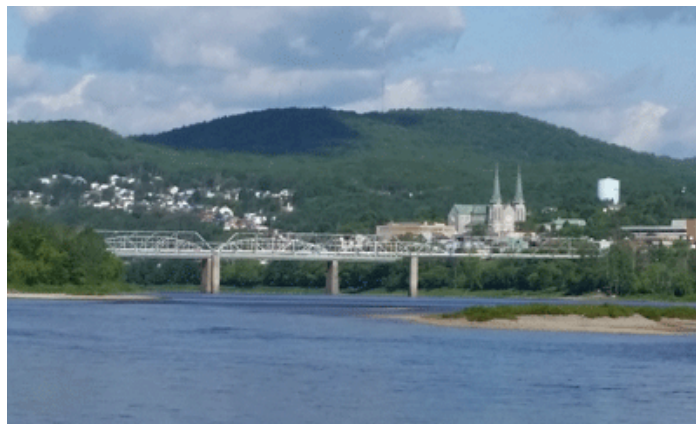
The Madawaska-Edmundston Bridge.

FHWA also facilitates the development and maintenance of the surface transportation system along the U.S.–Canada border to address existing and anticipated demand for cross border travel and trade while working with federal, state, regional, and local agencies, the private sector, and various stakeholders. In 2016, over 299,000 trucks , 2.2 million personal vehicles , and 3.4 million vehicle passengers crossed through the 25 Land Ports of Entry (LPOEs) along Maine's 611 miles of shared border with the provinces of Quebec and New Brunswick, Canada. 1,2