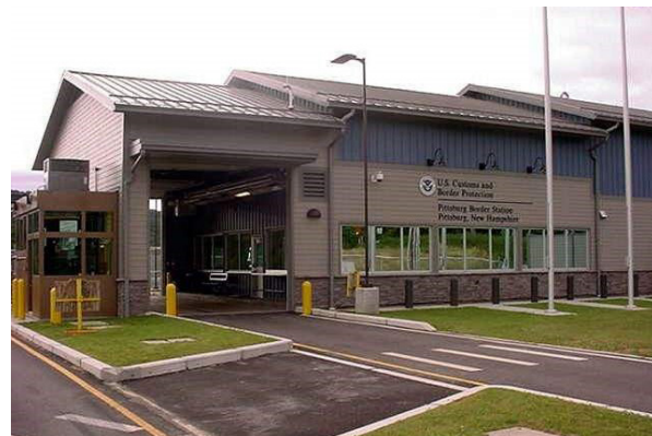
U.S. Customs Border Protection facility at Pittsburg, NH.

FHWA also facilitates the development and maintenance of the surface transportation system along the U.S.—Canada border to address existing and anticipated demand for cross border travel and trade while working with federal, state, regional, and local agencies, the private sector, and various stakeholders. In 2016, nearly 6,500 personal vehicles crossed through the one Land Port of Entry (LPOE) along New Hampshire's 58 miles of shared border with the province of Quebec, Canada. 1,2