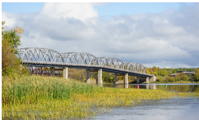
The Baudette-Rainy River Bridge.

FHWA also facilitates the development and maintenance of the surface transportation system along the U.S.–Canada border to address existing and anticipated demand for cross border travel and trade while working with federal, state, regional, and local agencies, the private sector, and various stakeholders. In 2016, over 58,000 trucks , 1.1 million personal vehicles , and 1.7 million vehicle passengers crossed through the seven Land Ports of Entry (LPOEs) along Minnesota's 547 miles of shared border with the provinces of Ontario and Manitoba, Canada. 1,2