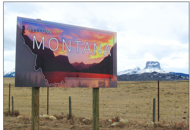
A billboard welcoming travelers to Montana.

FHWA also facilitates the development and maintenance of the surface transportation system along the U.S.–Canada border to address existing and anticipated demand for cross border travel and trade while working with federal, state, regional, and local agencies, the private sector, and various stakeholders. In 2016, 157,000 trucks , 672,000 personal vehicles , and 1.2 million vehicle passengers crossed through the 13 Land Ports of Entry (LPOEs) along Montana's 545 miles of shared border with the provinces of British Columbia, Alberta, and Saskatchewan. 1