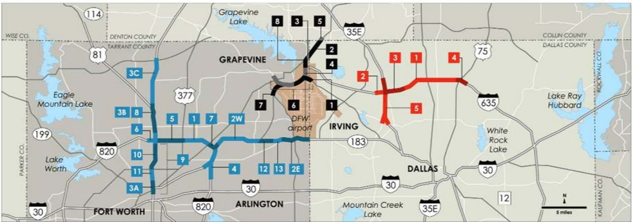
Figure 1. Map of the North Tarrant, DFW Connector, and LBJ Freeway projects. The North Tarrant project is highlighted in blue; the DFW project is highlighted in black. The LBJ Freeway project is highlighted in red.