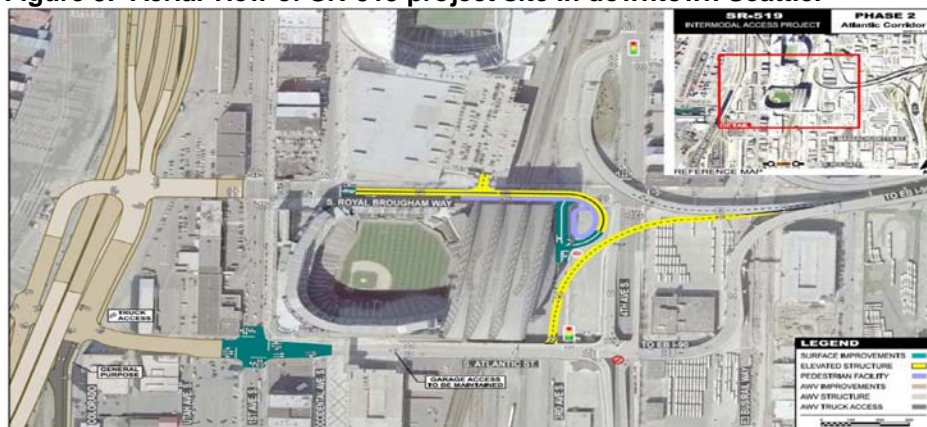
Figure 3. Aerial view of SR-519 project site in downtown Seattle.

WSDOT identified the alliance contracting approach as a way to consolidate project design and construction while addressing the project’s complex components. Using this approach, WSDOT set the project budget but the contractor had responsibility for selecting an appropriate design. Additional general components of this approach included: