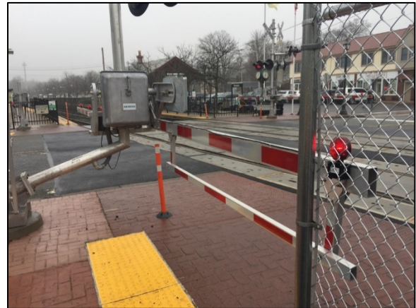
Figure 3. Gate Skirts and Fencing at Northeast Quadrant of E. Main St. Crossing in Ramsey, NJ

clearances between the lower gates and ground ranged from 26 to 28½ inches. Delineator posts were added to the 34–42-inch horizontal gaps remaining between the lower gates and gate posts. Sidewalk tactile pads were also added to all four approaches to the crossing. These additional improvements are shown in Figure 3 .