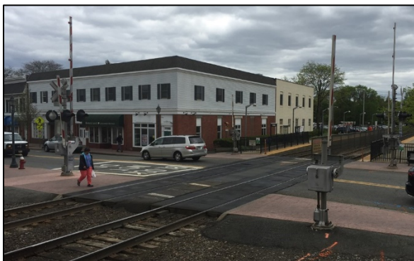
Figure 2. E. Main St. Crossing in Ramsey, NJ

NJ DOT selected the highway-rail grade crossing at E. Main St. (Crossing ID 263186S) in Ramsey, New Jersey. The crossing, as shown in Figure 2 , experiences about 110 activations per day, mostly for NJT service on the Main and Bergen County Lines and about 4–5 freight movements. The Ramsey station is adjacent to the crossing.