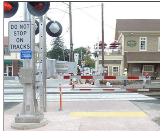
Figure 1. Gate Skirts Installed at E. Main St. Crossing in Ramsey, NJ

This work builds on an initial study of gate skirts conducted in 2012 with New Jersey Transit (NJT) and documented in an FRA Technical