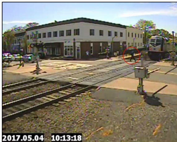
Figure 4. Baseline Type II Violation Example

For the pre-installation period, pedestrian movements at the crossing were analyzed for 7 consecutive days from 5/4/17 to 5/10/17. This was about 3 months before the pedestrian gates were upgraded to gate skirts. There were a total of 438 grade crossing activations with pedestrians present. A total of 27 pedestrians committed a Type I violation and 63 pedestrians and cyclists committed a Type II violation. A Type II violation example is shown in Figure 4.