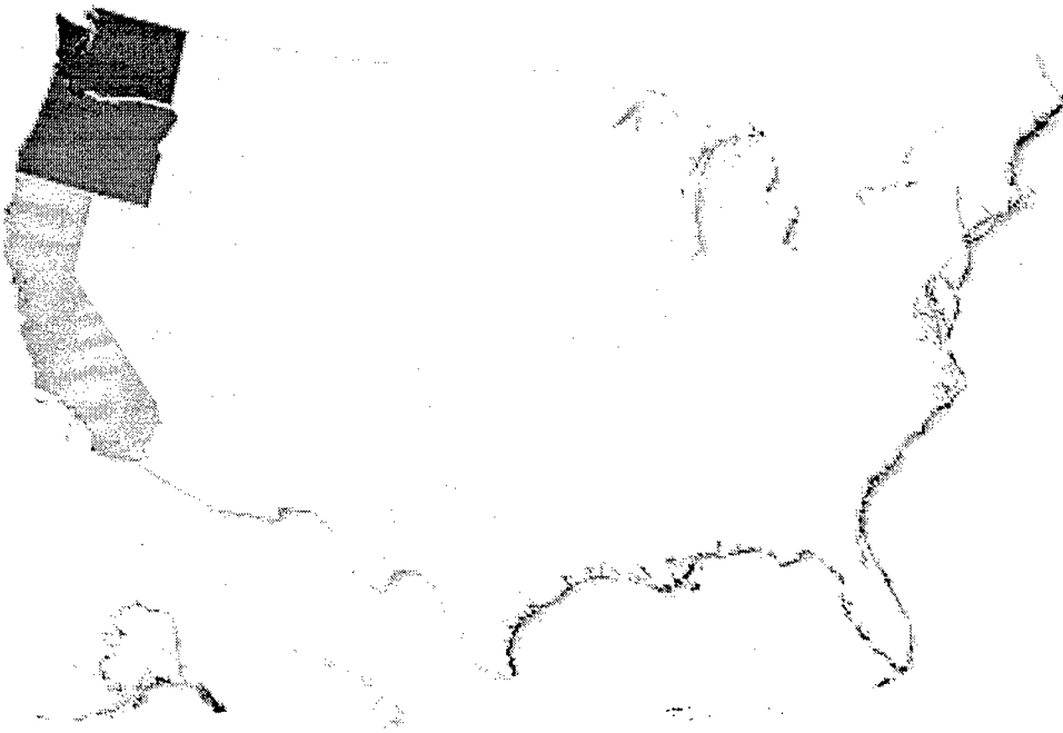
Table 2. Origin States of People Who Visit Washington (In thousands)