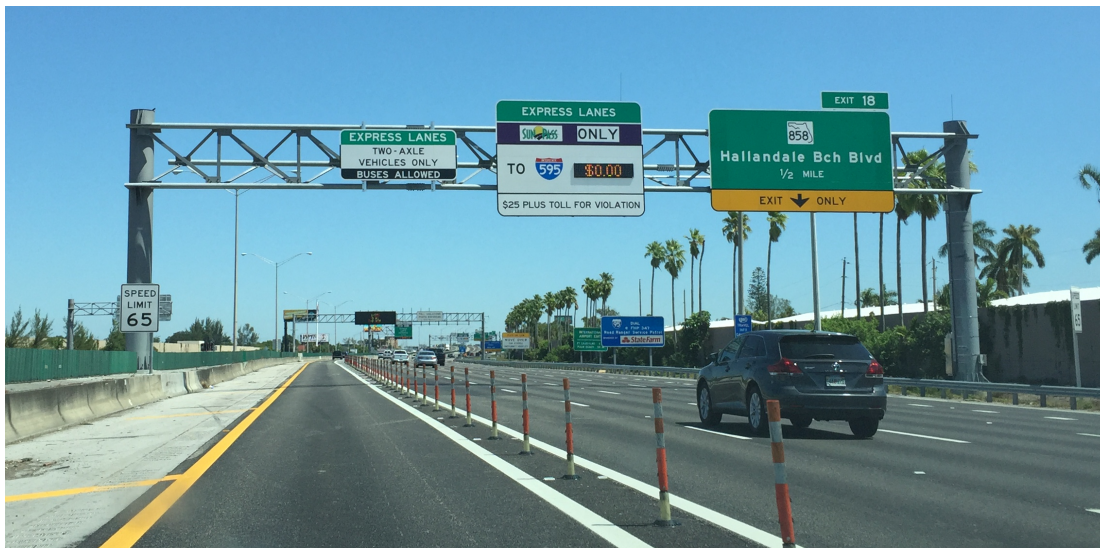
Figure 4: 95 Express Phase 2 Extension. 9

Phase 2 opened in October 2016, adding four more tolling points throughout the corridor. The lane distribution mirrors Phase 1, but widths remained at 12-feet. The buffer width is 2 feet with express lane markers at 10-foot spacing. The widening of bridges and the addition of auxiliary lanes occurred given the higher availability of public right-of-way. Figure 4 shows a visual of Phase 2 for the 95 Express.