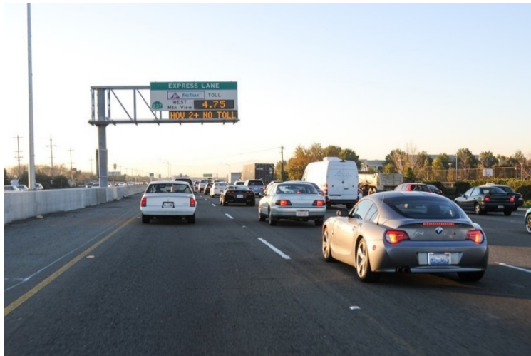
Figure 3: SR 237 Express Lanes. 8

The Santa Clara Valley Transportation Authority (VTA) received VPPP funds in 2012 to evaluate the potential of using different access approaches, such as continuous access with no painted buffer between the Express Lanes and general-purpose lanes. As part of this project, the project team removed one mile of existing striped buffer as a temporary pilot test. After 6 months of observation, VTA made the buffer removal a permanent change. This conversion extended the SR 237 express lanes about four miles to the west into the city of Sunnyvale. As part of this deployment, VTA studied more options for open and restricted buffer striping access arrangements. The analysis resulted in the selection of additional open access for separating express lanes from the general-purpose lanes. The SR 237 Express Lanes extension is currently under construction and has a scheduled opening date of 2019.