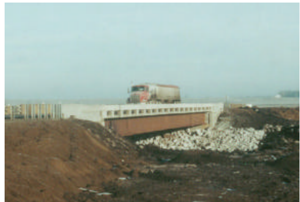
Photo 3.1.1 Snyder Bridge

The bridge was opened to traffic in October 1997. It is a 150-foot simple span bridge with 5 lines of plate girders of 4' 6" deep. The original design utilized conventional grade 50W steel. When HPS first became available, Nebraska DOT replaced the grade 50W steel with HPS 70W steel of equal size. The intent was to use this first HPS 70W bridge to gain experience on the HPS fabrication process. The fabricators concluded that there were no significant changes needed in the HPS fabrication process.