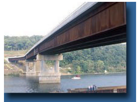
Photo 3.1.5 Ford City Bridge

It is a three-span continuous welded steel plate girder bridge with spans of 320'-416'-320'. The first span is curved horizontally with a radius of 508'. The other two spans are on tangent. There are four lines of girders spaced at 13.5'. HPS 70W is used in the negative moment regions and grade 50W elsewhere. This hybrid combination of steels resulted in 20% reduction in steel weight, and enabled the girder sections to be constant depth instead of haunched. By eliminating the variable web depth, a costly longitudinal bolted web splice was avoided.