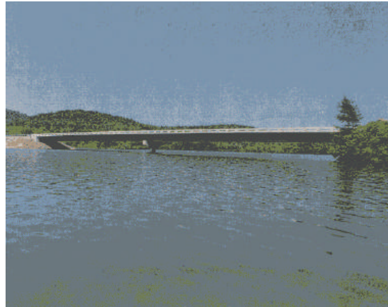
Photo 3.1.4 Martin Creek Bridge

In 1996, Tennessee Department of Transportation (TNDOT) was completing the design of the SR53 Bridge over the Martin Creek using ASTM A709 Grade 50W steel (See Photo 3.1.4). It was TNDOT's first steel bridge design utilizing the new AASHTO LRFD Bridge Design Specifications. The bridge consisted of two 235.5-foot spans, carrying a 28-foot roadway on three continuous welded plate girders spaced at 10' 6" on centers.