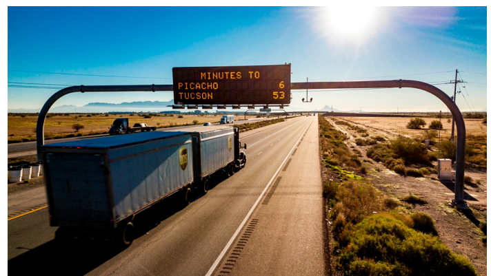
Real-time crowdsourced data allows dynamic message signs like this one to automatically update travel times for motorists in ARIZONA.

Because crowdsourced data are obtained whenever and wherever people travel, agencies can capture in real time what happens between sensors, in rural regions,