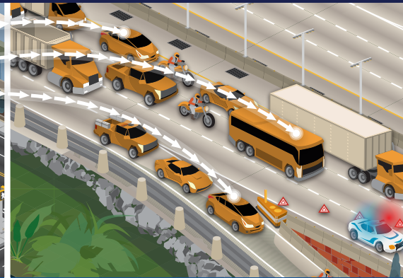
Real-time Driver Data

Transportation systems management and operations (TSMO) programs strive to optimize the use of existing roadways through tools such as traveler information, traffic incident management, work zone management, and traffic signal management. TSMO solutions can help mitigate congestion due to special events, adverse weather, traffic incidents, work zones, and planned maintenance. However, these solutions require real-time, high-quality, and wide-ranging roadway information. Gaps in geographic coverage, lags in information timeliness, and life-cycle costs for field equipment can limit State and local agencies' ability to operate the system proactively.