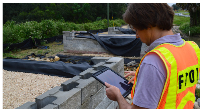
e-Ticketing uses mobile devices to access electronic ticket exchanges, improving material data handling and integration into construction management systems.

A paperless process for creating, sharing, tracking, documenting, and archiving materials information, accessible in real time via mobile devices, provides all