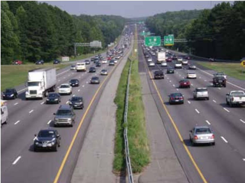
I-40 approaching Wade Avenue in Cary