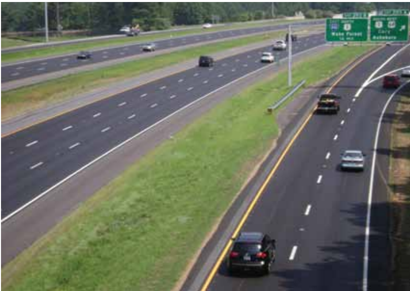
I-40 design-build widening project in Wake County