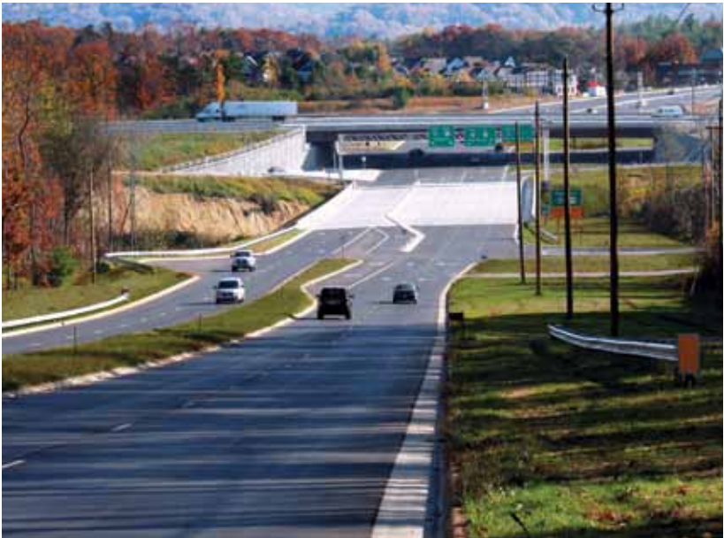
Newly constructed Interchange with I-26 and NC 146 in Asheville

To effectively manage available funds and address the needs of citizens, the agency categorized the network and prioritized investment strategies to maximize mobility and connectivity for a core set of highway corridors. The approach resulted in three tiers of the North Carolina Investment Network, which include, 1) the statewide tier that included the interstates and major primary highways that have the highest usage, connect major population centers and help mobility on long-distance trips, 2) a regional tier, that included minor US and NC designated highways, connected regional centers and serve the large