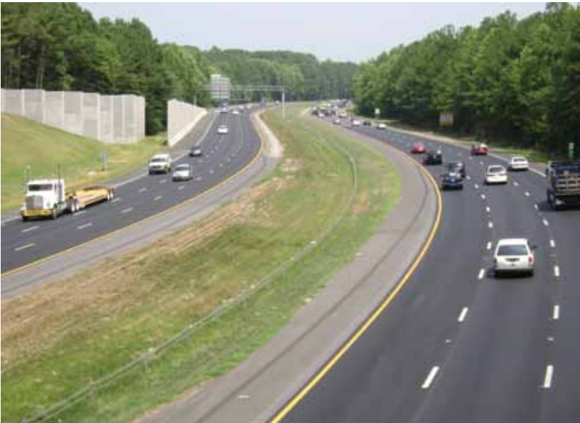
I-40 in Raleigh