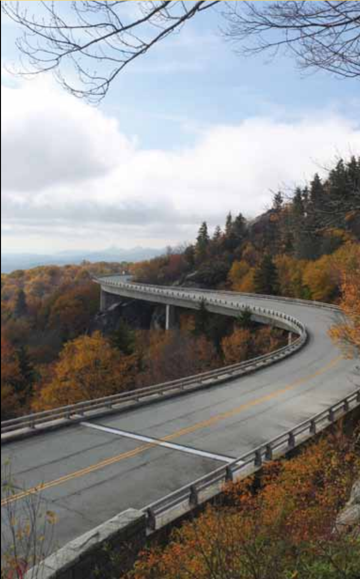
Linn Cove Viaduct

FRONT COVER PHOTO: Figure I-26 Interchange with NC 146 in Asheville