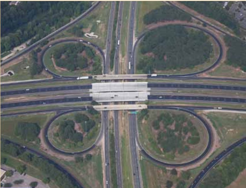
I-40 Cloverleaf Interchange with US 1 in Raleigh

The NCDOT leadership is actively working to ensure that the right measures are selected and the right targets are set for gauging the performance and condition of infrastructure assets. By aligning all organizational activities and tying each employee's performance, measured through the Performance Appraisal Dashboard, directly to accomplishing the agency's goals, the DOT has been able to engage the workforce and its various business units to take ownership in delivering the desired outcomes. The linking has increased collaboration within and across business units as well as with other resource agencies and business partners. This approach has