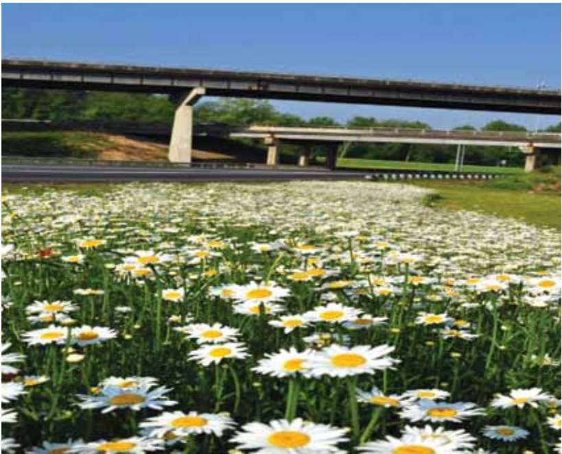
I-40 and I-240 interchange in Asheville—pavement, bridges, and roadside features

In 2008, NCDOT revised its performance targets to more realistically reflect the existing roadway conditions. The agency has also implemented an internal Performance Dashboard Appraisal (PDA) to measure employee performance towards meeting agency goals. Through the PDA, the performance of the agency