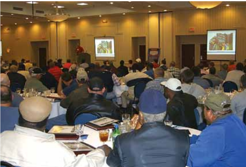
Department leadership discussing asset management principles at NCDOT maintenance conference

The agency then focused on aligning all internal efforts and energies on the mission of “Connecting people and places in North Carolina—safely and efficiently, with accountability and environmental sensitivity” . With all arrows aligned, the agency’s business units developed and implemented strategies to deliver its mission. As business units took ownership and became champions of the mission, the implementation of the strategic objectives became a bit easier.