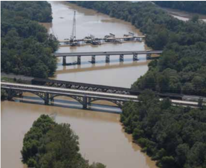
Aerial view of the new I-85 bridges under construction, existing I-85 bridge, railroad bridge, newly rehabilitated Wil-Cox Bridge and old highway bridge over the Yadkin River

NCDOT has the second largest inventory of aging bridges in the nation. These bridges are expected, over the next few decades, to reach their end-of-life in large waves. To address this, the agency has set aside monies and has a program completely focused on addressing aging bridges. Management