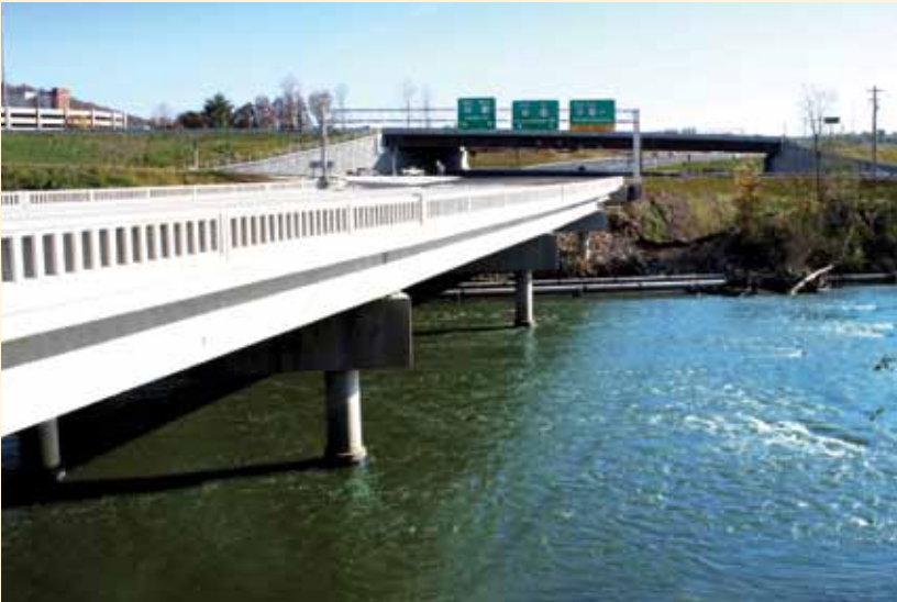
New bridge at I-26 Interchange with NC 146 in Asheville

This case study involved interviewing the leadership and staff at the state transportation agency, researching, reviewing and compiling information about the agency practices, systems and processes in use. The State transportation agency approves the case study report prior to publication. The case study report relies on the agency's perspective, experiences and self-assessment. The case studies are intended to help other transportation agencies understand and learn from the experiences of peer agencies. Readers should understand that geographical, organizational and political environments influence the implementation of practices across the nation and customization may be required for specific application. ■