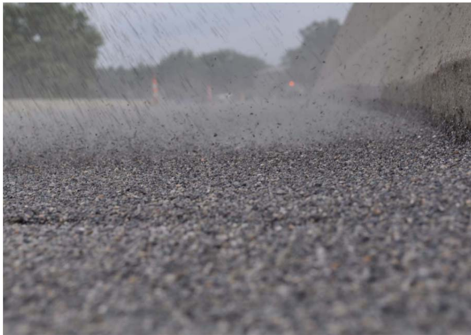
Figure 3 – I-229 Southbound