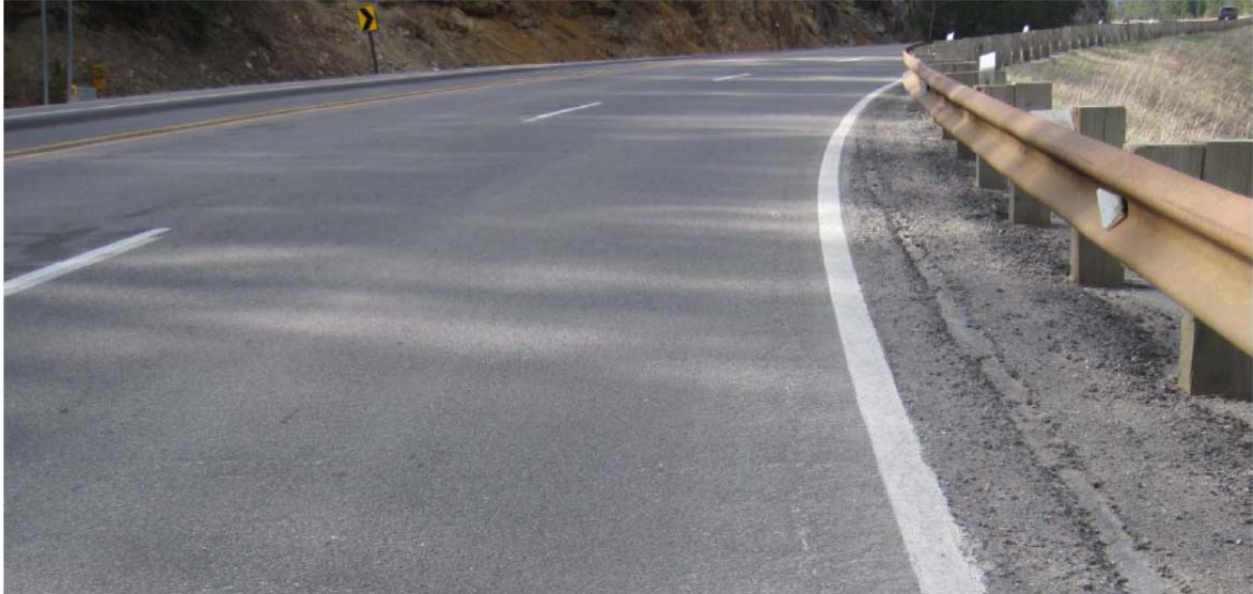
Figure 2 - US14A – South of Lead