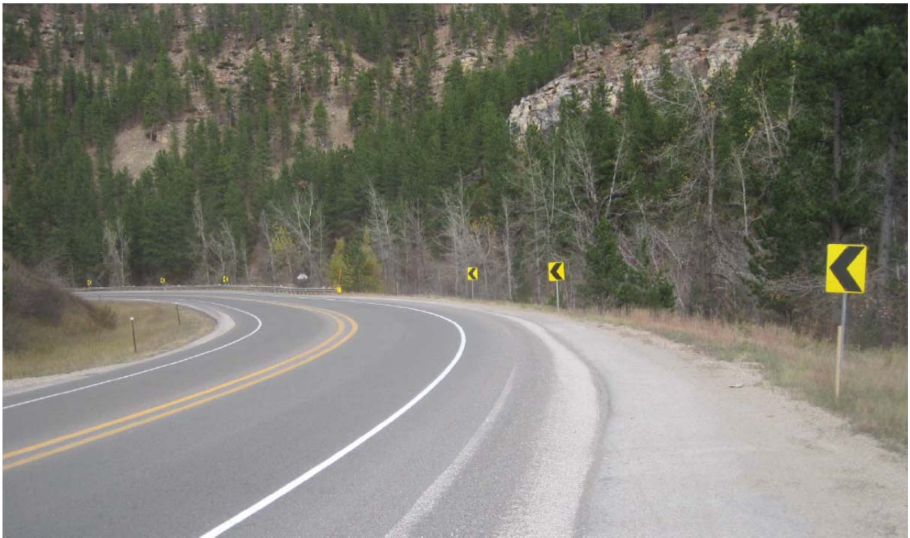
US14A West of Sturgis