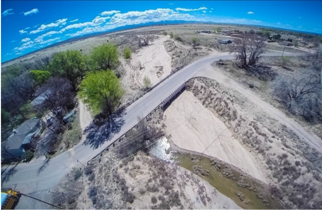
Figure 4. Photo. Project area before.