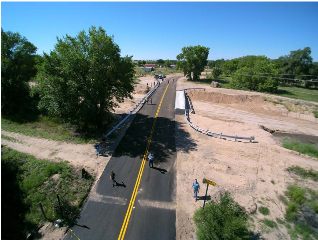
Figure 5. Photo. Project area after.