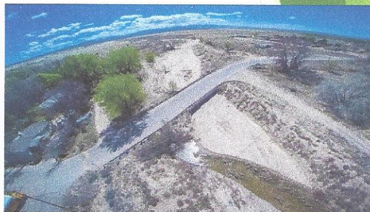
White Swan Bridge Prior to Construction